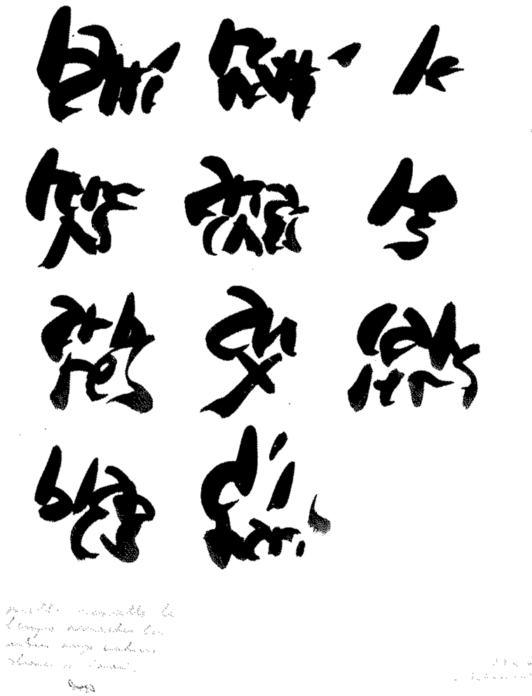
FIGURE 3 Dotremont's 1964 logogram 'natté renatté' (Dotremont, 2022, 19). Christian Dotremont, 1963–1964, inv. CDPO 03200/1963/003, Coll. Fondation Roi Baudouin, on deposit at the AML, Brussels.

Each ink cluster forms a word written in the paratext. For example, the middle cluster in the top row, 'renatté', is divided into two levels as 're/natté'. Apart from the unusual separation of syllables and word fragments, the logogram's text is read in a relatively standard way, from left to right and from top to bottom, line by line. The literary meaning of the work is understandable, but its mode of expression does not follow the usual patterns or categories of perception (Veivo, 2009, 82). Because of this intentional liminal space between writing and drawing, logograms cannot be assigned to preordained genres, as they do not implement the usual codes of writing and literature.