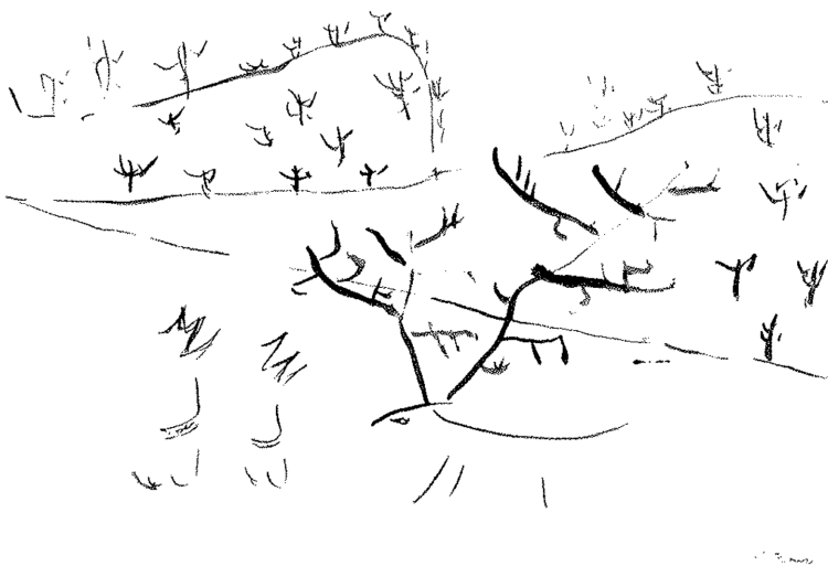
FIGURE 4 A 1961 untitled pre-logogram depicting Sápmi (Dotremont, 2011, 23).

The 'pre-logogram' lacks an explanatory paratext, so the sign system is not determined akin to the poetics of later logograms. Hence, it is unclear whether the word-drawing in question is to be viewed or read—or whether it is a logogram. The pre-logogram can be approached either iconographically or literary-theoretically. As iconography focuses on the elements of the image and leads the viewer to consider the work as a drawing, it can be interpreted as a form of stylised mimetics. In this reading, the diagonal lines dividing the image represent topographical forms of the landscape, and the figures at the bottom represent two Sámi and a reindeer. The shape of the trees and twigs poking out of the snow and the reindeer's horns resemble, in Dotremont's words, 'unknown calligraphy' (Dotremont, 1985, 47). However, if the work is read as literature, the diagonal lines can be seen as dividing the field of writing, akin to calligraphy. The details, iconographically interpreted as representing figures and elements of nature, can then be regarded as resembling asemic writing. The deliberate blurring of representational strategies shows how the liminal space of sign systems impacts the perception and interpretation of the work.