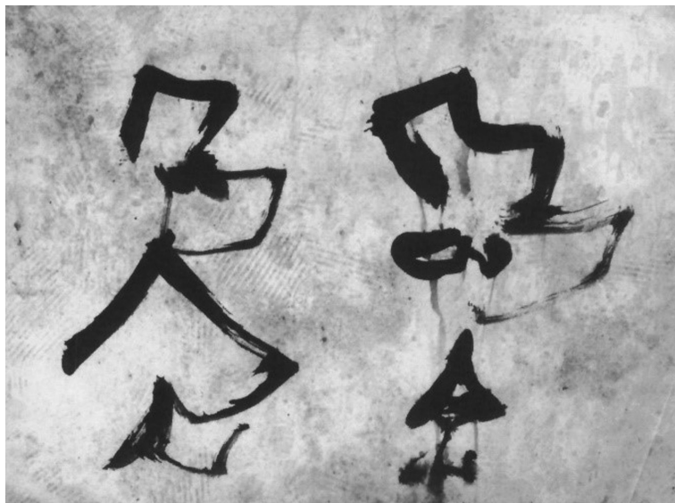
FIGURE 1 Dotremont's early drawing of the Sámi from 1962 (Walecka-Garbalinska, 2015, 52). Christian Dotremont, 1962, inv. CDDO 00708/1962/001, Coll. Fondation Roi Baudouin, on deposit at the AML, Brussels.

Dotremont's first drawing of the Sámi already thematises his gaze (see Figure 1). The drawing depicts two abstracted figures in gákti and sávká , a Sámi outfit and headgear. Also pictured are the tapered-headed nutukas (Sámi boots). The costumes are so conspicuous that the figures wearing them appear as mere vertical skeletons supporting the garments. Such association of Sámi identity with external characteristics is problematic. Especially from a contemporary perspective, Sámi clothing is one of the key objects of decolonisation processes. 22 Descriptions of Sámi attire are equally problematic, with Dotremont likening Sámi costumes to a 'child's drawing'. However, the characterisation should be understood in the context of CoBrA, that is, as a