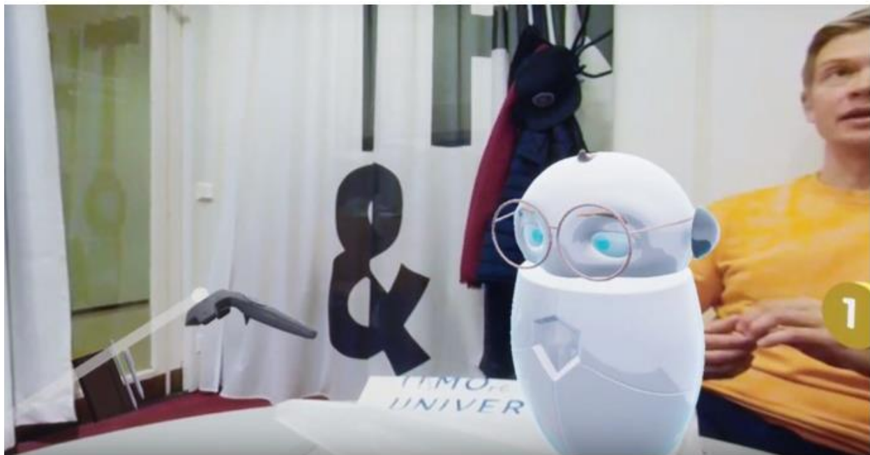
Figure 3. 360-sphere with a play-area in the middle allowing free movability and interactions for the user (an avatar figure).

These identified problems initiated the next iteration round with solution objectives being all the previously achieved solutions including scalability [1, 22] interactive content [17, 31] higher level of learning through personalization [45] 360 photo and video environments [16] as well as advanced pedagogical models [24]. In addition to those, we added simple content production for the teachers and simple consumption for the students as solutions objectives. Finally, a new pedagogical model was needed to be adapted to all other solution objectives and accumulated design knowledge (see e.g., [23]).