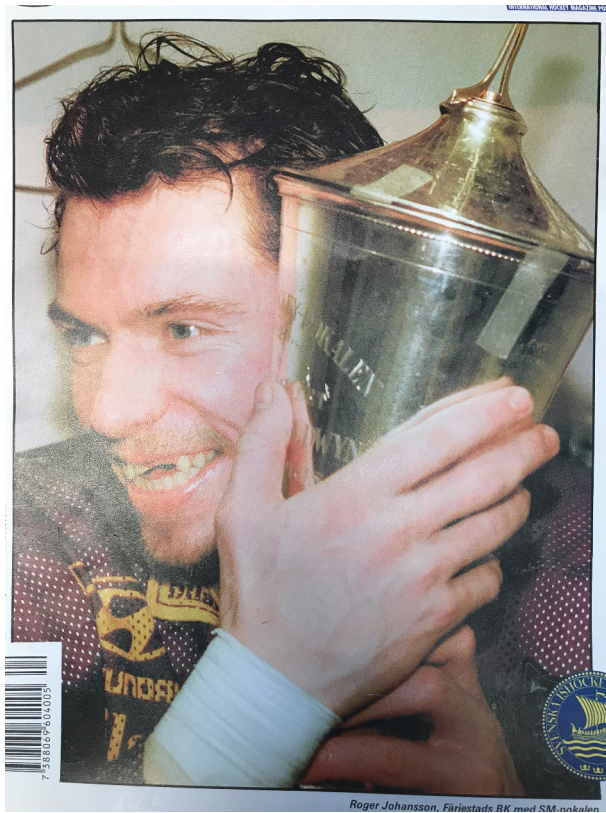
Figure 2. Hockey (1997) issue 4, cover.

overcome the pain and the ‘borders’ of his body’s materiality (Messner 2012). This discursive domination over materiality symbolises the player’s power and status. The photograph is on a cover of the Hockey magazine, which is also of symbolic importance. The missing teeth and the absent materiality echo his vulnerability, and thus add a dimension of complexity to the image: that even the most successful and status-loaded (discursive) subject is anchored in material fragility.