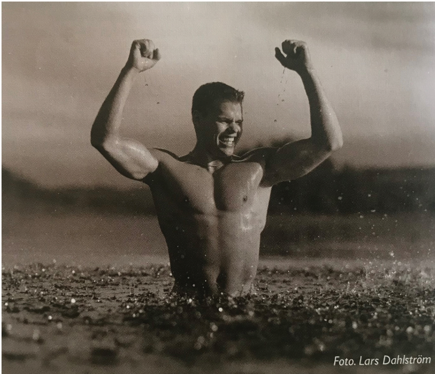
Figure 1. Hockey (1999) issue 9, p 24.