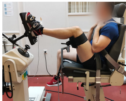
Figure 2. Testing position of ankle inversion/eversion strength measurement.