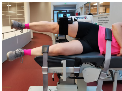
Figure 4. Testing position of hip abduction and adduction.