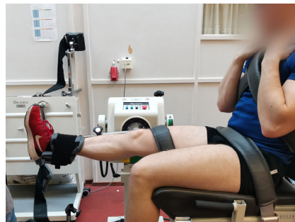
Figure 3. Testing position of knee extension and flexion.