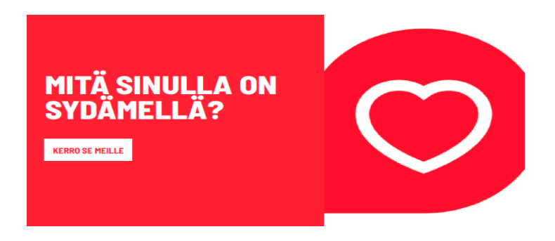
Figure 5. The Social Democratic Party's main heading and illustrations on the Finnish homepage, which translates to What is on your mind? Tell us. (sdp.fi)

It is also important to recognize that these headings do not appear as separate entities but are part of the homepage alongside with other resources and modes. This is what O'Halloran (2011: 121) calls intersemiosis , where meaning arises from the combination of several semiotic resources rather than separate resources. Figure 5 shows an example of a main heading that translates to What is on your mind – tell us , however; the Finnish version of it makes a word connection to heart, so a word-to-word translation would be What is on your heart . The heading relates to the Social Democratic Party's colors and the party's symbol, which is also a heart. This inevitably supports a representation of warmth and a community and builds an image of the party as a community that is interested in the visitor of the website.