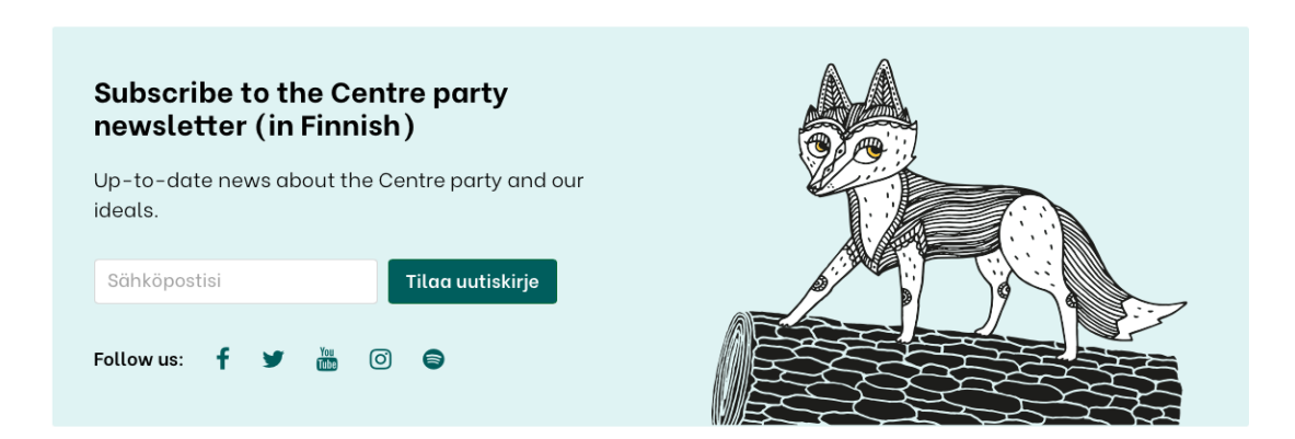
Figure 1. An example of the use of Finnish on the Center Party's English homepage (keskusta.fi/en).

An initial reaction that stood out from many of the websites was that the websites mixed languages in quite many places. Many of the English homepages were not completely in English, but Finnish could be seen for example in menus, headings, and other sources of information. Figure 1 features a screenshot from the English homepage of the Centre Party that here functions as an example of an instance of mixing English and Finnish. In this example, the text on the English homepage offers the visitor information about subscribing to a newsletter but the newsletter itself is in Finnish. The command "Tilaa uutiskirje", which translates to Subscribe to the newsletter , is also in Finnish even though the rest of the text is in English.