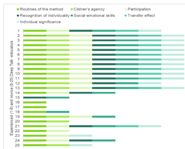
Fig. 4. Details of the narratives categorised by novice and experienced Deep Talk educators and the classification of the details in the narratives.

Differences in the narratives were found when comparing the results between novice and experienced Deep Talk educators. For the novice Deep Talk educators, the details focused on the notions made during the session, and experienced learners obtained details inside and outside the Deep Talk sessions. Fig. 4 illustrates how the meaning of the Deep Talk method seems to change when it is used more frequently. The experienced educators found more elements from categories referring to the inner meanings, the transfer to other activities and the communication between the children. There was a disparity between the novice and experienced Deep Talk educators, as the novice educators did not systematically mention all categories in their narrations, whereas the experienced educators mentioned all categories