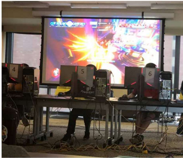
9 Figure 1. Overwatch game play was done in teams of six players in the same large room with 10 audiences watching on the competition screens.