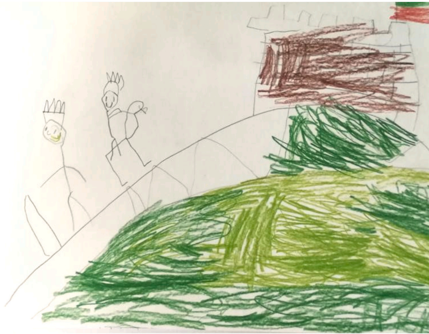
Fig. 7. Drawing by children from Lithuania depicting Gediminas hill and the castle tower with two figures that seem to wear crowns, one on foot and the other presumably on a horse. © The children.