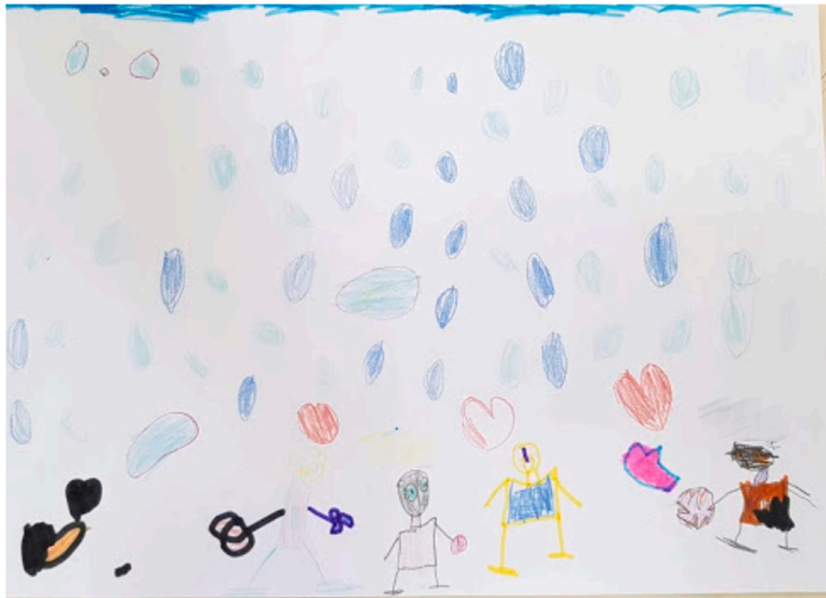
Fig. 5. Drawing by children from Israel depicting four figures playing ball in the rain. © The children.

implement the practices and principles of democratic culture to jointly solve problems and disagreements in their everyday environment and to collaborate for common interests. These drawings and their explanations show how the children participated in the interaction with their peers and how the drawing task in the lesson offered diverse opportunities for it.