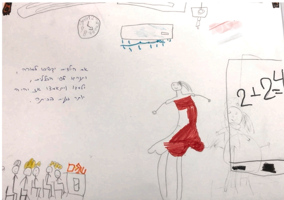
Fig. 2. Drawing by children from Israel depicting a smiling teacher teaching mathematics to smiling students who sit on chairs in a classroom. © The children.

themselves and their peers. These imaginings are commonly depicted and explained as based on reciprocity: The child recognizes what their peer is good at and, thus, can help and support another child who lacks that skill or is less skilled, and suggests how the other child can offer help in return. Compared to the first category, these drawings indicate a more interactive approach to practising democratic culture. The explanatory texts of the drawings in this category commonly draw on the first-person point of view emphasizing the child's own role in the process of interaction. For instance, a child from the UK explains their drawing by saying: 'I think we need to be more like the ants and do things together more. My friend is really good at maths and she helps me. I don't know what I can help her with. Maybe dancing or running because I'm really good at that!' In the drawing, the child has depicted a group of smiling figures in a framed space, assumably peers in their classroom. The idea of 'being more like the ants' in the film is dealt with in the drawing that includes a sentence: 'I think we can work together.'