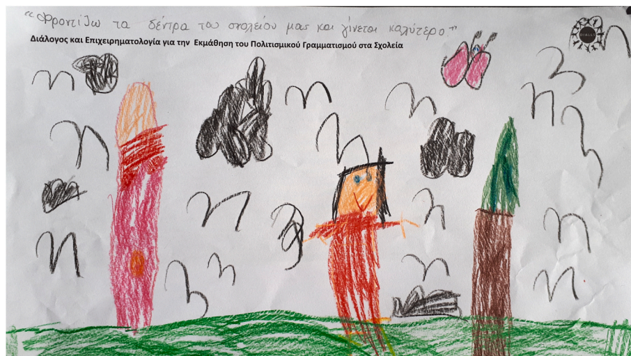
Fig. 4. Drawing by a child from Cyprus depicting a smiling figure standing outside surrounded by objects interpreted as trees, flying birds, and a butterfly. © The child.

Such examples in the data indicate children's ability to apply and