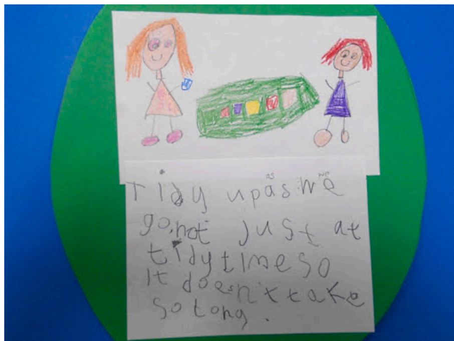
Fig. 1. Drawing by children from the UK depicting two smiling figures standing next to items organized in a straight row. © The children.

In the second thematic category, the children move from the elaboration of rules to imagining and suggesting acts and practices that they can do to make their classroom or school more comfortable for both