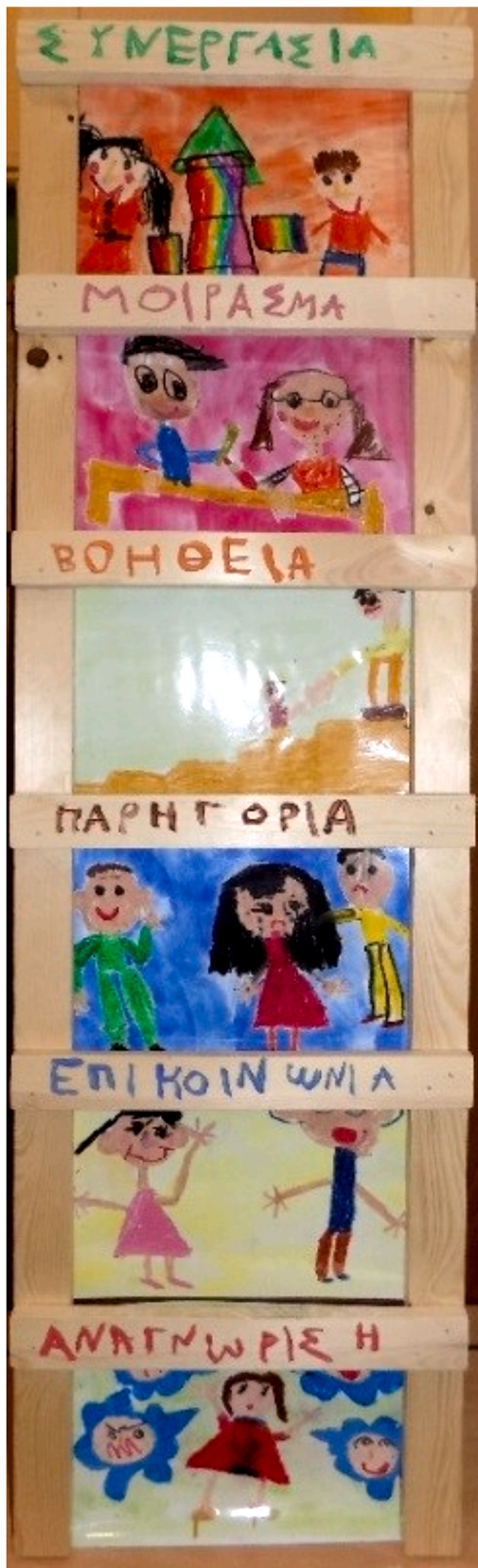
Fig. 6. Drawing by children from Cyprus illustrating events that are entitled 'cooperation,' 'sharing,' 'help,' 'comfort,' 'communication,' and 'recognition.' © The children.

dialogic chain of thinking led some small groups, for instance, to explicitly explore rules, while other groups focused on depicting novel solutions to make their classroom and school more fun and enjoyable places to study. Similarities in the explanations of the drawings reflect the same mechanism. Dialogic meaning-making led the children to describe their drawings with vocabulary and expressions jointly used in their small group or class.