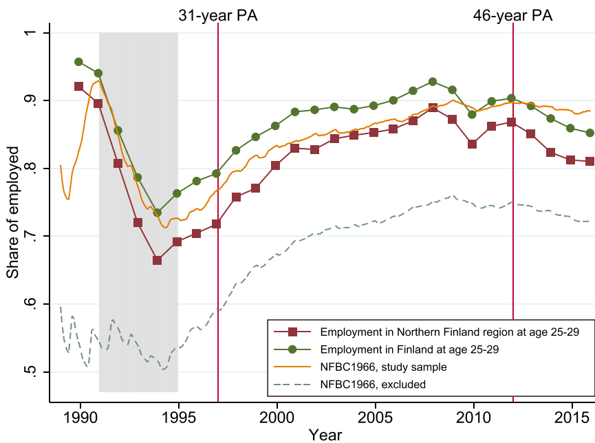
Fig. 1. Employment rates among study sample and young adults, 1989–2015. Note: Employment of the Northern Finland Birth Cohort 1966 (NFBC1966) who were employed for two-thirds of the time in 1990 and aggregate share of employed at age 25–29 in Northern Finland (15–64 year-olds in the workforce; data from Statistics Finland). The employment data for NFBC1966 are smoothed monthly averages computed from pension accrual spells. The shaded area corresponds to the years 1991–1994, the years defined as the Finnish Depression of the early 1990s in this study.

Hence, we focus on the population already tightly attached to the labor market at the age of 24. As Figure 1 shows the excluded population, as a whole, displays considerably weaker labor market attachment prior to and after the economic contraction. Individuals in the excluded group were either studying for an academic degree, unemployed, employed only part-time, on maternity leave, or out of the labor force in 1990. For these individuals, the impact of nonemployment on physical activity is ambiguous, as they were not attached to the labor market to begin with. We therefore exclude them from the study sample.