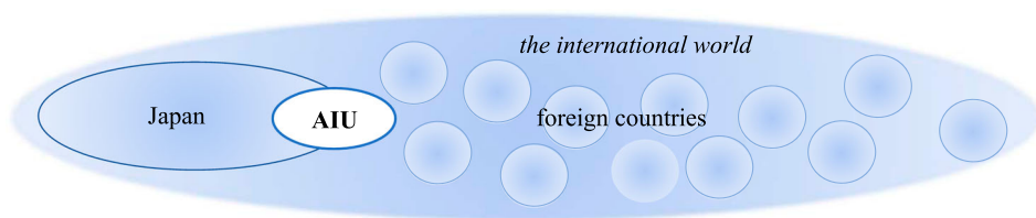
Figure 4. AIU as a mediator between the local and international community.

from Finland or foreigners for mutual exclusion, depending on whether they speak Finnish as their first language or not. They would also be grouped as foreign-language-speaking cosmopolitans for inclusion, foreigners as those who speak their first languages as international languages in JYU and locals as those who possibly speak foreign languages as international languages.