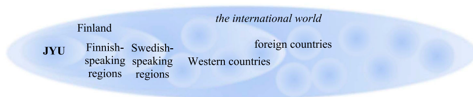
Figure 3. JYU as part of a larger international community.

In Extract 1, Finnish is highlighted over other languages in the portrayal of JYU having 'a strong Finnish-speaking tradition'. Also, the apparently contrasting notion of 'a multilingual and multicultural academic community' can be interpreted as putting an emphasis on Finnish over foreign languages because multilingualism and multiculturalism are linked to 'different nationalities' to introduce the notion of national language based on a monolingual view of national membership. In this policy-level text, Finnish is clarified to be the national language of Finland in contrast to foreign languages as international languages, the ones brought into JYU by foreigners through internationalization, to result in the construction of de jure multilingualism/monolingualisms in the language policies of JYU. Students would thus be primarily classified as either locals