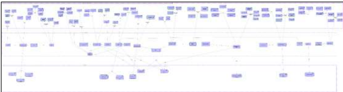
Fig. 1 Yoma Governance Model

The governance model's primary concern is to list the actors participating in the Yoma ecosystem. The actor is an entity that is capable of performing behaviors or activities in Yoma. The governance model attaches a role for each actor. The role is the characteristic set of behaviors or activities undertaken by Yoma actors. Multiple actors can share the same role if they perform the same activities. For example, Guardian and Youth are sharing the role as educational credential holders. Social Impact Organization, Education Opportunity Provider, and Youth Credential Verifier also share the same role as Yoma Organizational Member. The governance model presents actors/roles essential details like the rights, responsibilities, rules, and incentives. Rights are a privilege to perform a particular behavior or activity. Responsibility is a behavior or action that actors or roles can be held accountable for. The rule is a regulation or principle that governs conduct in Yoma. The incentives are the motivational factor of the actors or roles to take action. Fig. 1 Yoma Governance Model.