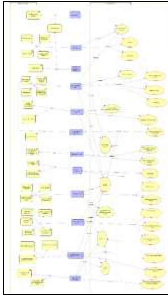
Fig. 2 Yoma Business Model

The technology model represents the technologies used and applied in Yoma. Technology elements can be categorized into three main categories: technology architecture and infrastructure, services and, data. The technology architecture comprises platforms, applications, frameworks, software, and middleware. Platform refers to tools, libraries, and reusable components that facilitate value creation. Applications encapsulate the Yoma web application. Frameworks are software libraries (components, interfaces, and tools) that enable the development of a technological solution. Middleware is software that facilitates the integration of different components within a unified interface, such as the integration of different Yoma components. Services in the Yoma context are user notifications, educational and job onboarding, and a trustful connection. Data do not include the collected information only but also present different varieties for data storage (database, Indy ledgers, user wallets). Fig. 3 shows the Yoma technology model.