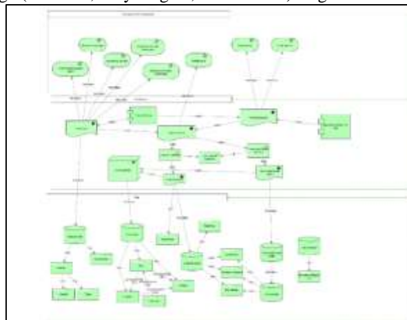
Fig. 3 Yoma Technology Model

The technology model represents the technologies used and applied in Yoma. Technology elements can be categorized into three main categories: technology architecture and infrastructure, services and, data. The technology architecture comprises platforms, applications, frameworks, software, and middleware. Platform refers to tools, libraries, and reusable components that facilitate value creation. Applications encapsulate the Yoma web application. Frameworks are software libraries (components, interfaces, and tools) that enable the development of a technological solution. Middleware is software that facilitates the integration of different components within a unified interface, such as the integration of different Yoma components. Services in the Yoma context are user notifications, educational and job onboarding, and a trustful connection. Data do not include the collected information only but also present different varieties for data storage (database, Indy ledgers, user wallets). Fig. 3 shows the Yoma technology model.