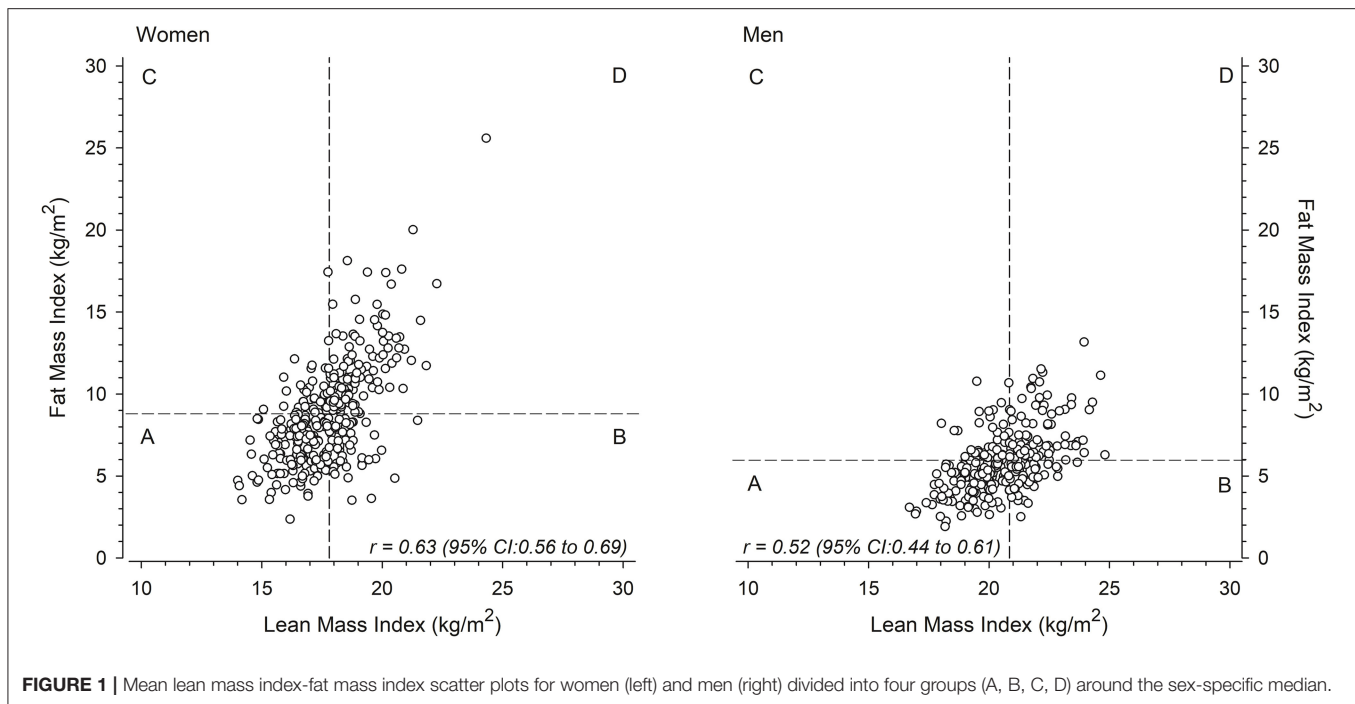
FIGURE 1 | Mean lean mass index-fat mass index scatter plots for women (left) and men (right) divided into four groups (A, B, C, D) around the sex-specific median.