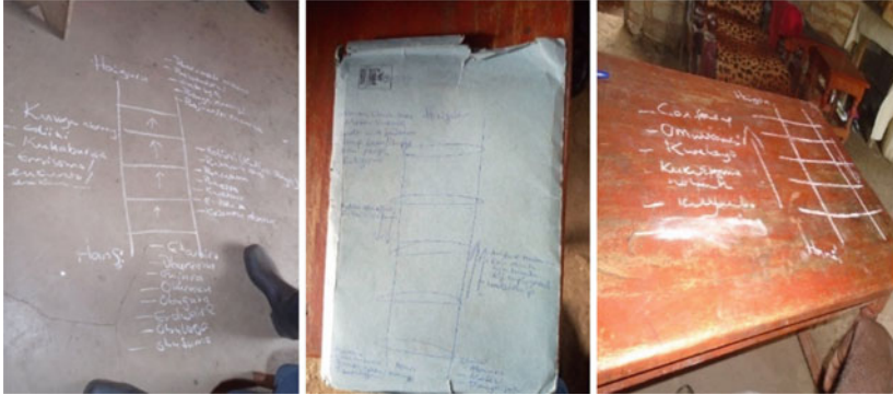
Fig. 1 Samples of field participatory discussion frames of ‘ladder of citizenship’

which the acquisition and learning of the characteristics of perceived good citizenship were discussed. The concrete articulations of learning were further combined into five categories, which illustrate the diverse ways in which learning was conceptualized.