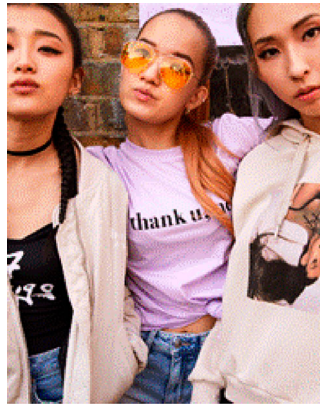
Figure 10. Image URL: https://www.facebook.com/hmsuomi/photos/a.1923897201169167/3057059124519630/?type=3&theater. Source: https://fi-fi.facebook.com/hmsuomi/. Date of access: 10 July 2020.

at the camera and so at the onlooker of the image. The words “thank u, next” are inscribed on her T-shirt, making an intertextual reference to Ariana Grande’s popular song about her multiple ex-boyfriends (Grande 2018). The visual arrangement makes both the girl and the words inscribed on her T-shirt prominent. The latter viewed along with the pouting, winking and her heavy eye makeup—that accentuates the wink—give the image of the girl a sexualised character. It makes one wonder if the “next” in “thank u, next” indicates sexual frivolity. It could even be read as a mark of power, suggesting that the girl can choose and dismiss who she courts, thus signifying individual choice and agency.