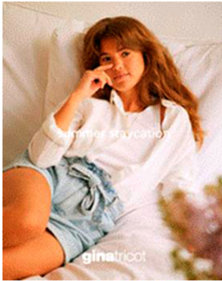
Figure 8. Image URL: https://fi-fi.facebook.com/GinaTricot/photos/a.10150107818417896/10157505646827896/?type=3&theater. Source: https://fi-fi.facebook.com/GinaTricot/. Date of access: 10 July 2020. Reuse not permitted.

However, the theme of innocence is distinct in both images and gets expressed through the predominantly white background and the dreamy look on the girls' faces. By picturing an older girl in a manner reminiscent of a young child, Figure 7 helps in reproducing the traditional discourse of girlhood innocence and sustains the notion that older girls are primarily asexual. Figure 8 produces the notion of girlhood innocence but intermixes it with sexuality by playing with both elements.