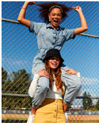
Figure 14. Image URL: https://www.facebook.com/hmsuomi/photos/a.1923897201169167/3266748903550650/?type=3&theater. Source: https://fi-fi.facebook.com/hmsuomi/. Date of access: 10 July 2020. Reuse not permitted.

This image shares certain features with Figure 13 that was discussed under the visual construction of active self-presenters and self-surveyors. In both images girls are shown having fun in an outdoor environment. However, we chose not to categorise that image under the visual construction of carefree girls because we noted several essential differences between the two images. Girls in this visual construction are having fun with each other, whereas the girls in Figure 13 are engaged in acts like looking at themselves in the mirror or taking selfies that seem to construct them as self-conscious. The textual emphasis in Figure 13 is on the self-presentation of girls.