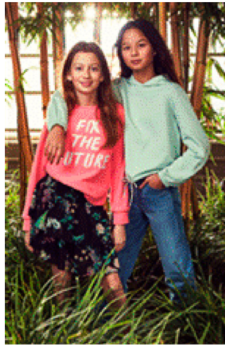
Figure 15. Image URL: https://www.facebook.com/KappAhlSuomi/photos/a.1538935169722245/2596914433924308/?type=3&theater. Source: https://fi-fi.facebook.com/KappAhl/. Date of access: 10 July 2020.