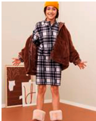
Figure 12. Image URL: https://www.facebook.com/Lindex/photos/a.10150778194024094/10156879744324094/?type=3&theater. Source: https://fi-fi.facebook.com/Lindex. Date of access: 10 July 2020.

Both images deploy gestures that indicate confidence. In Figure 11, gestures like the girl facing the camera with a smile, hands on her waist, chin up, heels resting on the floor and the toes of a foot in the air reflect confidence. In Figure 12, confidence is indicated through gestures like the girl