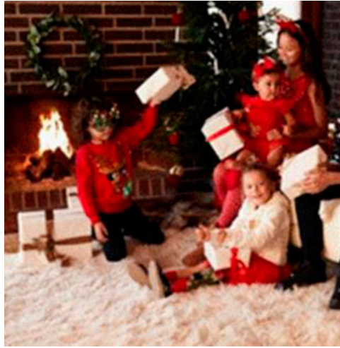
Figure 5. Image URL: https://www.facebook.com/KappAhlSuomi/photos/a.1538935169722245/2523190361296716/?type=3&theatre%5C. Source: https://fi-fi.facebook.com/KappAhl/. Date of access: 10 July 2020. Reuse not permitted.

the camera while the girl child gazes at the floor. Though the older girl is not directly caring for the girl child in this image, she is pictured alongside a child with a plastered leg hence someone potentially in need of care.