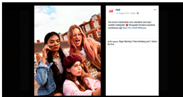
Figure 13. Image URL: https://www.facebook.com/hmsuomi/photos/a.1923897201169167/3080119108880298/?type=3&theater. Source: https://fi-fi.facebook.com/hmsuomi/. Date of access: 10 July 2020.

Both the images in Figures 11 and 12 portray girls as actively and confidently presenting themselves. Similarly, Figure 13 shows them as engaged in self-surveillance, with the text calling upon them to make active choices in buying new clothes to present their bodies. Therefore, these images together articulate the notion that girls are “naturally” inclined towards self-presentation and practise self-surveillance, but it has been well-packaged in ideas of choice and agency that characterise postfeminist girl power discourses using textual and visual strategies.