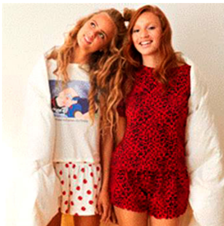
Figure 7. Image URL: https://www.facebook.com/hmsuomi/photos/a.1923897201169167/3180550135503861/?type=3&theater. Date of access: 10 July 2020.