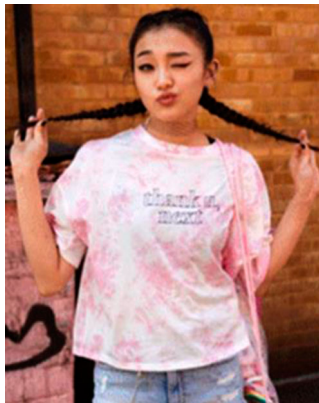
Figure 9. Image URL: https://www.facebook.com/hmsuomi/photos/a.1923897201169167/3057059121186297/?type=3&theater. Source: https://fi-fi.facebook.com/hmsuomi/. Date of access: 10 July 2020.

In Figure 9 , a girl of Southeast Asian origin stands holding her braids on both sides, simultaneously winking and pouting, and wearing heavy eye makeup. She is pictured looking directly