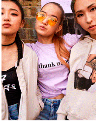
Figure 10. Image URL: https://www.facebook.com/hmsuomi/photos/a.1923897201169167/3057059124519630/?type=3&theater. Source: https://fi-fi.facebook.com/hmsuomi/. Date of access: 10 July 2020.

at the camera and so at the onlooker of the image. The words “thank u, next” are inscribed on her T-shirt, making an intertextual reference to Ariana Grande’s popular song about her multiple ex-boyfriends (Grande 2018). The visual arrangement makes both the girl and the words inscribed on her T-shirt prominent. The latter viewed along with the pouting, winking and her heavy eye makeup—that accentuates the wink—give the image of the girl a sexualised character. It makes one wonder if the “next” in “thank u, next” indicates sexual frivolity. It could even be read as a mark of power, suggesting that the girl can choose and dismiss who she courts, thus signifying individual choice and agency.