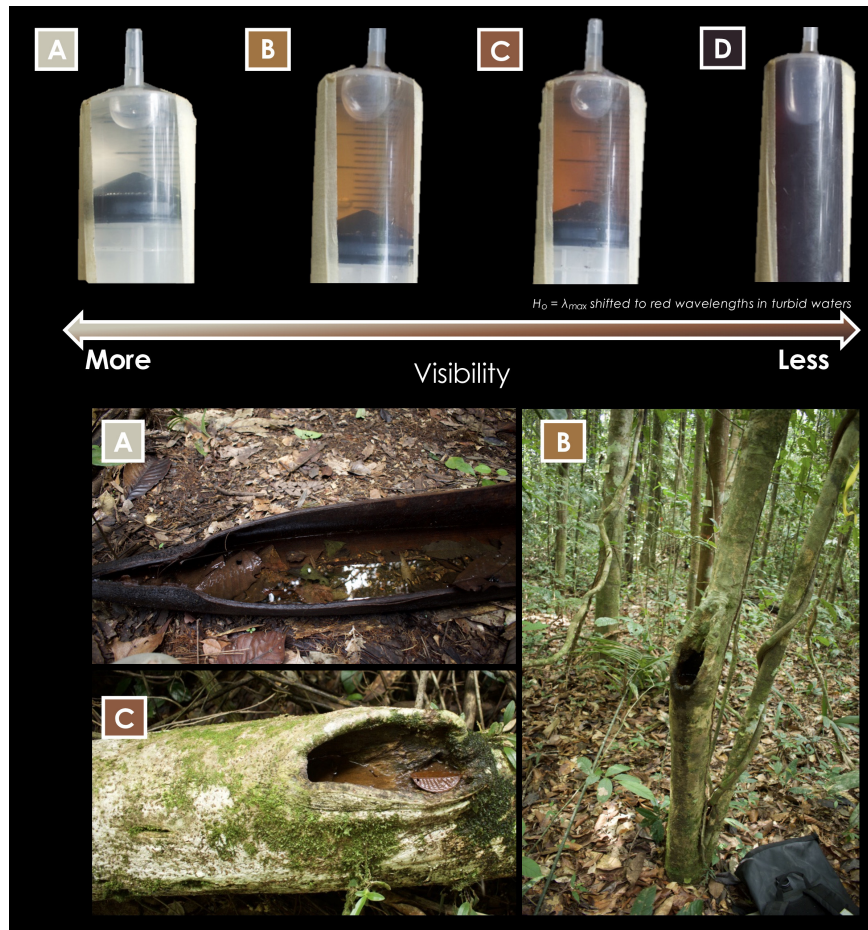
FIGURE 1 | Water samples (collected by CF) from phytotelmata occupied by Dendrobates tinctorius tadpoles in French Guiana. Based on water samples, it appears that tadpoles are deposited in pools with a wide range of visibility. Colored labels refer the water sample (top of figure) to the pool from which it was collected. We hypothesize that in darker waters tadpoles' spectral sensitivity is red-shifted (lower Vitamin A1:A2 ratio).

composition in tadpoles versus juveniles of the frog Lithobates sphenoccephalus (Schott et al., 2021). If these gene products were ones to affect light transmittance in a wavelength-dependent manner (e.g., Röhl, 2001), the finding would argue against the speculation outlined just above, and highlight the need to explore the issue in more species to find -or rule- out potential patterns.