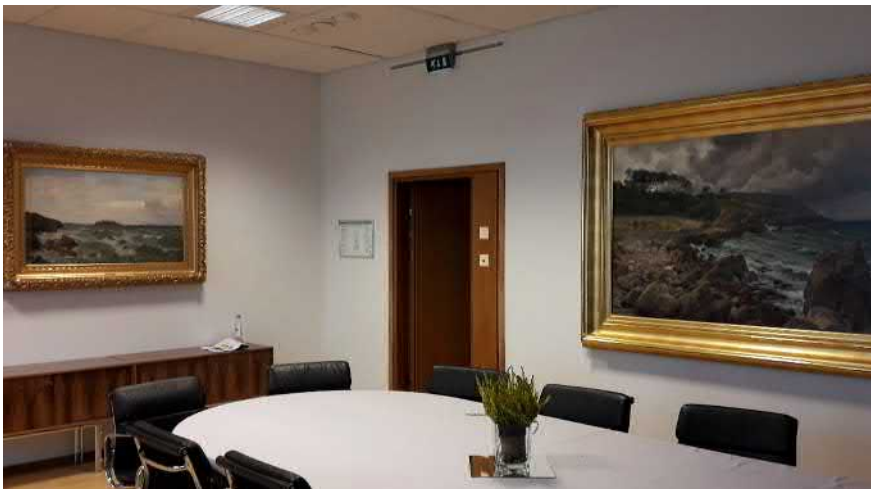
Figure 1. Works of art in the collection of Fortum Art Foundation in Espoo 2017.

Today a typical Finnish corporate art collection comprises around 400–800 works of art created by canonised Finnish and regional artists. The largest Finnish corporate art collection currently numbers around 3000 works. The focus in many companies is on maintaining and displaying the collection instead of acquiring new. This means that corporate support in the form of art purchases of the latest Finnish visual art is currently modest.