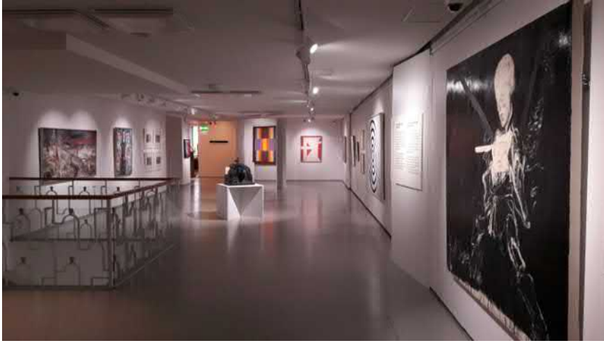
Figure 3. The STSY's exhibition One Hundred Years, A Thousand Meanings (2017) with online publication and numerous art education activities, was organised in collaboration with the Jyväskylä Art Museum. This exhibition was the most-visited one in 2017 at the Jyväskylä Art Museum.

If museum ethics can be avoided in corporate collecting, companies do follow the ethics of the International Chamber of Commerce (ICC). The ICC has published guidelines for marketing and advertising, and principles of sponsorship and corporate social responsibility are included in the guidelines. 9 There is a lot of literature on sponsorship and different definitions of it (Lewandowska 2015; Olkkonen 2002). Below is the definition by ICC: