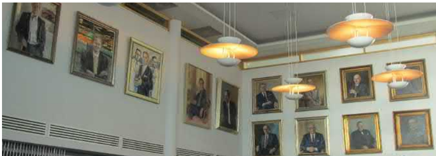
Figure 2. Portraits of top management in SOK's Art Collection. SOK is a co-operative with a long art collecting history. The portraits are permanently displayed in the conference room of the headquarters in Helsinki.

Traditionally, only single or small groups of artworks have been disposed of in Finnish corporate collections, but during the 2010s several large-scale disposals were carried out. What were the motives for these large-scale disposals? I will briefly introduce some recent cases of disposals in corporate art. The first regards portraiture. Portraits of board members and CEOs are examples of the changing nature of preferences of corporate curators. Finnish business has a long tradition of commissioned portraits, which are in most cases displayed in boardrooms, corridors and auditoriums, as figure 2 shows. Large collections often comprise dozens of portraits representing CEOs or other board members. Today, a few of them are usually on display in each collection, and the rest are either put into storage, donated to other collections or sold. Some respondents who were working as CEOs or board chairs said that they did not want the company to invest in portraits anymore. This culture of displaying business heroes, which are mainly males in formal suits with an office view in their background, seems to be changing. As noted in previous research, the tendency to separate ownership and leadership sometimes results in collection disposals or terminating a corporate collection altogether (Barendregt et al. 2009; Betts 2006; Leber 2008). Alongside changes in organisation culture and people who are responsible for corporate image, the legitimisation for disposals is gradually taking place.