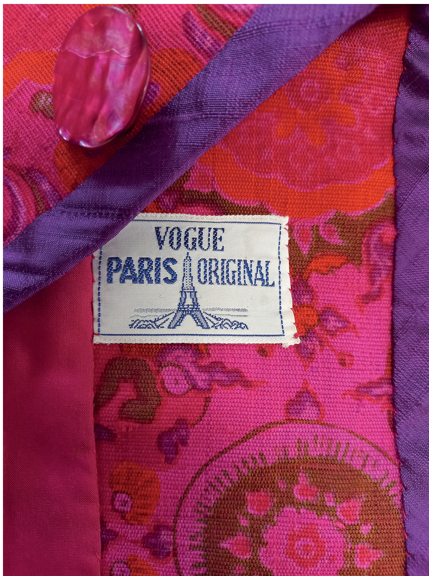
Image 3. A detail of a jacket designed by Yves Saint Laurent, c. 1967. The label 'Vogue Paris Original' is sewed in the lining.

practices and identities' (Dyer 2021). The relationships between objects, their users, the past and the present can be affective, social, cultural and economic. On the whole, the slippery term incorporates the material properties, use, consumption, production and exchange of objects. Meanings can be personal and individual, as well as public and collective. (Gerritsen & Riello 2015).