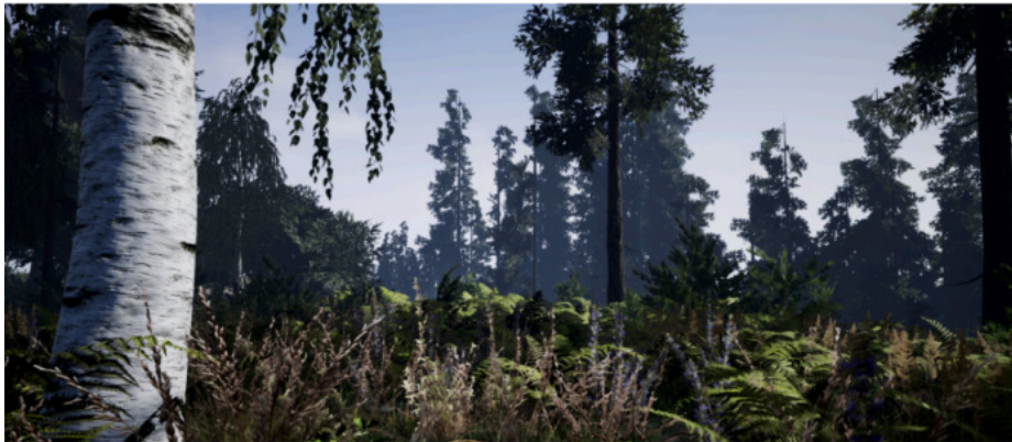
Fig. 1. Virtual Forest Environment.

Following the four components of a restorative experience introduced by Kaplan [19], and previous research on the topic, a VR-based virtual forest was developed. The VR environment (Fig. 1) was built using Unreal Engine [37] and shown to the participants with HTC Vive Pro -headsets [39]. The VR environment included several elements, which have been found out to have a restorative effect in previous studies: warm color temperature [34], blue sky [40], flying butterflies [25], bird singing [31], and ability to see the horizon and close nature objects ([19, 29, 33]).