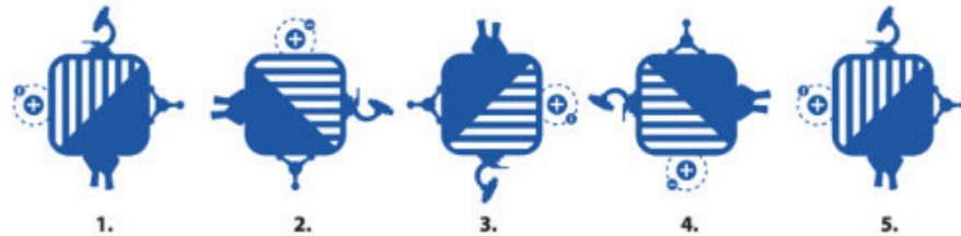
Fig. 2. Examples from the problem-solving tasks.

Which object does not belong to the group?