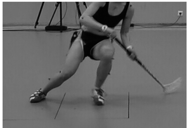
Figure 3. A floorball player performing the 180-degree pivot turn on the force plates.

synchronously at 300 and 1500 Hz, respectively. We conducted a static calibration trial before the test to determine the anatomic segment coordinate systems. Marker trajectories were identified using Vicon Nexus software. Both movement and ground-reaction force were filtered using a fourth-order Butterworth filter with cutoff frequencies of 15 Hz. 15 The contact phase was defined as the period when the unfiltered ground-reaction force exceeded 20 N.