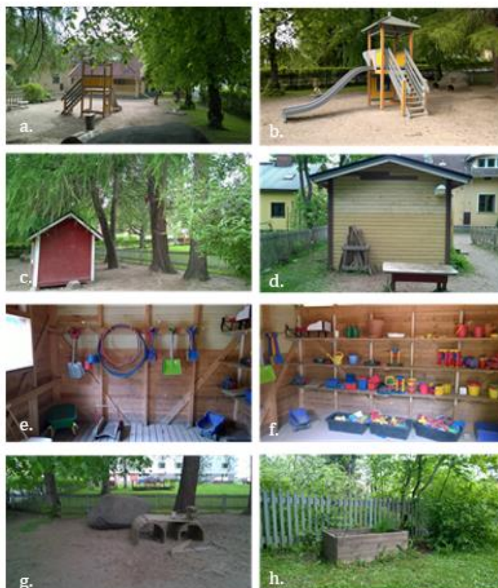
FIGURE 1 Photographs from the yard of the ECE unit: (a) the ECE unit building, (b) slide, (c) playhouse and trees, (d) the equipment storage unit, (e) equipment in the storage unit, (f) equipment in the storage unit, (g) the rock and (h) vegetation

The yard of the ECE unit was flat, about 40 by 30 metres (1200 m 2 ) in size, with a sandbox, a slide, swings, a seesaw, a playhouse and various play equipment in a storage unit, which children were allowed to pick up freely. There were some natural elements, such as eight trees, larger rock, grass, and other vegetation. The ECE unit building (about 20 by 10 metres) was at the other end of the yard (Figure 1).