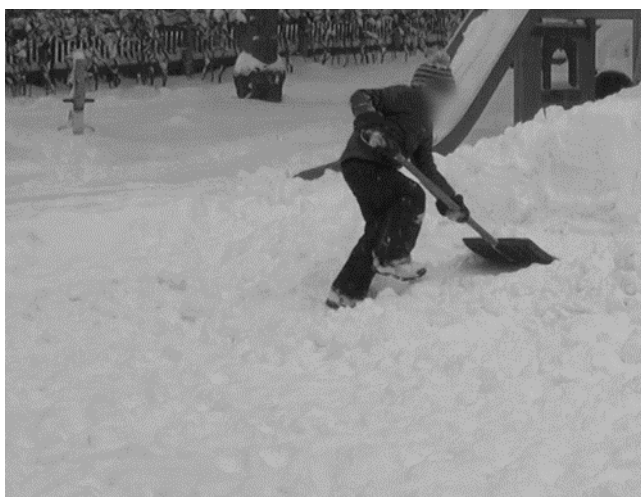
FIGURE 7 Shoveling snow

yard. The findings of this study may suggest that such an environment with snow piles and the availability of equipment, such as shovels (Figure 1 e.) and bumps, suitable for snow activities may physically activate a child in winter (Figure 7). For example, shovelling has been shown to be an activity that more than quadruples children's physical energy expenditure compared to their resting level (Butte et al., 2018). Previous Norwegian studies have shown that moving in the snow can have additional benefits. Bjørgen's (2015) study in one ECE unit indicated that during outdoor play, children's well-being, involvement and intensity of physical activity were at their highest during snow activity situations. Another longitudinal Norwegian study showed that versatile physical activity in the wintery forest had beneficial effects on children's physical and motor performance (Fjørtoft, 2001).