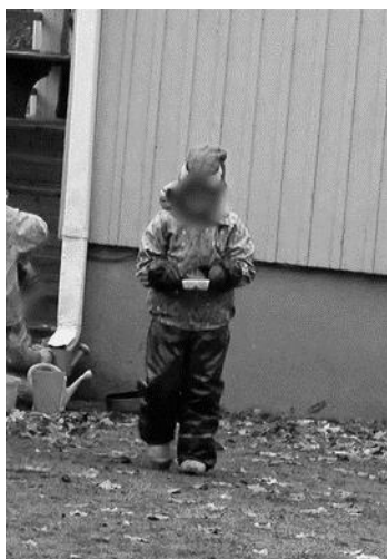
FIGURE 4 Movement of water in a container from one place to another

day of the autumn videoing, the weather was rainy and cool, and the air humidity was very high at about 95%, which may have contributed to John's low level of physical activity. Studies have shown that cool and rainy weather may have a detrimental effect on children's physical activity (Carson & Spence, 2010). In contrast, rainwater in its various states (e.g., flowing from gutters, forming ponds or absorbing into the sand) may serve as a physically activating stimulus, which our findings may also suggest (Appendix 2). For example, water as an irregular natural material can stimulate children's imaginations and creativity (Bento & Dias, 2017) and thus inspire the movement of water in containers from one place to another (Figure 4).