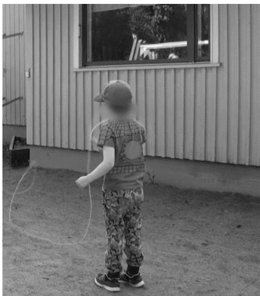
FIGURE 8 Jump rope manipulation

Iivonen, Niemistö, Sääkslahti & Kettukangas.