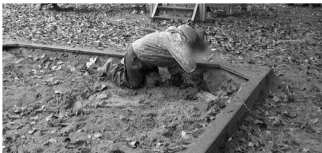
FIGURE 5 Manipulating sand