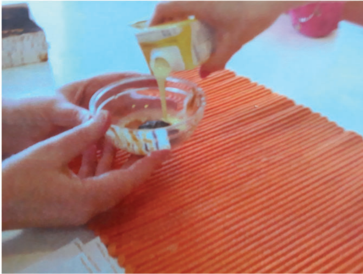
Figure 6. Multisensory discourse interaction.