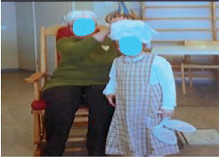
Figure 1. Trying on old clothes.