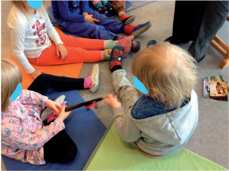
Figure 5. Interaction with an object.