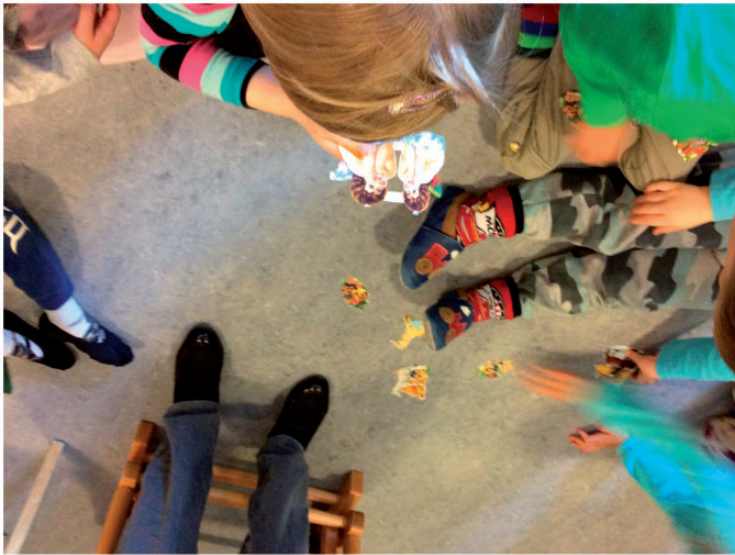
Figure 3. Playing games.

to keep warm! There were few department stores, so we made coats from animals killed, and these lasted for a long time.'