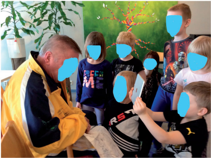
Figure 4. Multimodal co-participation.