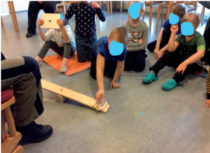
Figure 2. Interacting leading the story.

co-participation with modality created an emotional interaction between the older storytellers and the children. The children's questions sprang from their participation and thus guided the storytelling narration. They asked, 'It is so heavy! How could you wear it?' The elders laughed and answered, 'We had to,