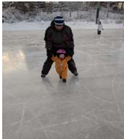
Picture 4. Ice challenges balancing abilities

Ice: Ice creates a slippery surface to challenge children's balance. Walking and sliding on the ice strengthen children's leg muscles while they try to keep their balance, specifically keeping the centre of the gravity above the support point. Decreasing the size of the supporting area inspires children to try different equipment like skates, skis and toboggans. Moving on ice supports the development of balancing skills that are prerequisites of advanced locomotor skills. (Picture 4)