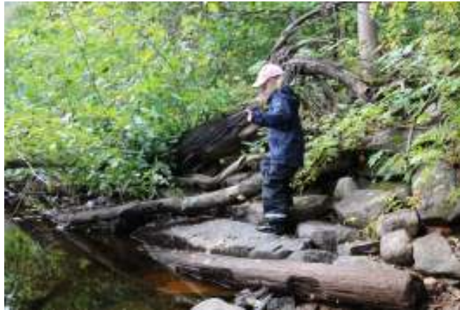
Picture 1. Forest offers lot of affordances

Forest: Picture 1 concretizes the multiple affordances the forest offers to children. For example, different trees are attempting to balance, climb, hang off and throw. Stones of different sizes attract to balance, jump, climb, carry, push and pull, as well as throw. Water in the forest makes an exciting place to jump over or a place to release sticks and leaves to float. (Picture 1)