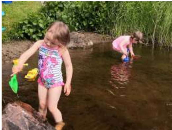
Picture 2. Water activities stimulate children's senses

Lakes: Natural water in lakes and rivers offers interesting sensorial stimuli; when moving in water, the water's temperature and pressure are recognized in the skin. Water activities stimulate first perceptual-motor activities and enhance mainly manipulative skills supporting fine motor development. If adults encourage children to walk until the water reaches hip level, the possibility of learning aquatic skills increase, and learning swimming skills begins. Swimming needs the ability to coordinate whole body segments (such as arms, legs, trunk and head) in a rhythmic way. Playing with different large floating equipment challenges children's balancing skills. (Picture 2)