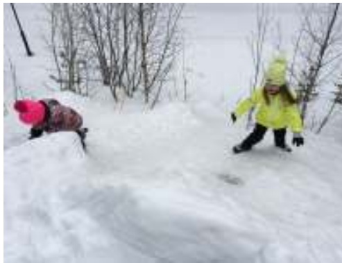
Picture 3. Snow offers a stimulating environment to challenge motor coordination

Ice: Ice creates a slippery surface to challenge children's balance. Walking and sliding on the ice strengthen children's leg muscles while they try to keep their balance, specifically keeping the centre of the gravity above the support point. Decreasing the size of the supporting area inspires children to try different equipment like skates, skis and toboggans. Moving on ice supports the development of balancing skills that are prerequisites of advanced locomotor skills. (Picture 4)