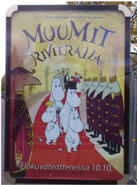
Fig. 6 “The Moomins in the Riviera”