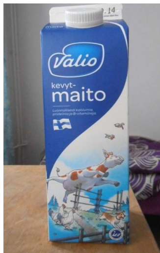
Fig. 7 Milk carton

Our next example (Fig. 7; Excerpt 7) emphasizes the mobility of objects as facilitators of learning. Caroline took a photo of a milk carton in her home, and her textual narrative recalls shopping experiences in Finland. This dual locatedness of the case calls our attention to links that are established between different sites of learning (in this example, shops and home, but also, as in the previous example, Finland and other countries).