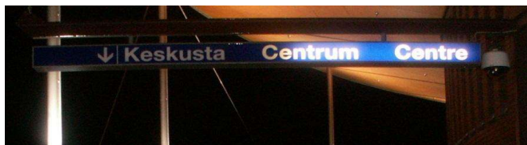
Fig. 5 “Centre”

The next example (Fig. 5; Excerpt 5) is also from the Travel Centre of Jyväskylä. In this case, the same student captured direction signs showing the way to the city centre.