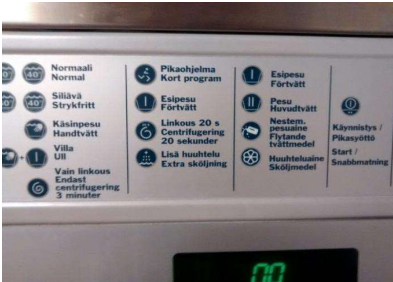
Fig. 8 Control panel of a washing machine

text in Finnish (first row) and in Swedish (second row). The bilingual Finnish-Swedish control panel also seems to be a manifestation of the manufacturer's awareness of the national language policy.