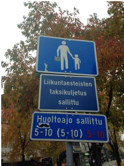
Fig. 1 Pedestrian area with restrictions