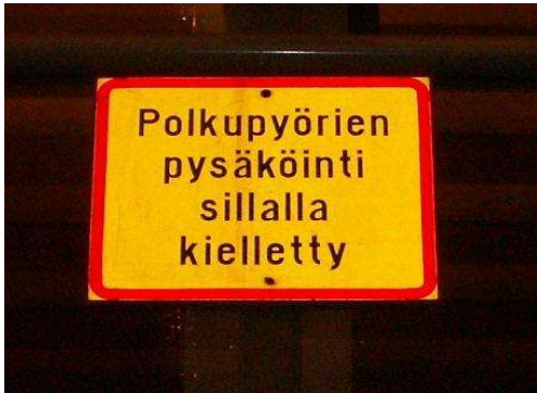
Fig. 4 “Leaving bikes on the overpass is forbidden”

Our first example (Fig. 4; Excerpt 4) is about a prohibition sign near the Jyväskylä Travel Centre which is here referred to with its Finnish name Matkakeskus . The travel centre is a junction of train and bus lines and the sign in question forbids leaving bikes on the overpass. It is also worthwhile mentioning that the student chose a Finnish-language pseudonym Kiitos which translates as ‘thank you’.