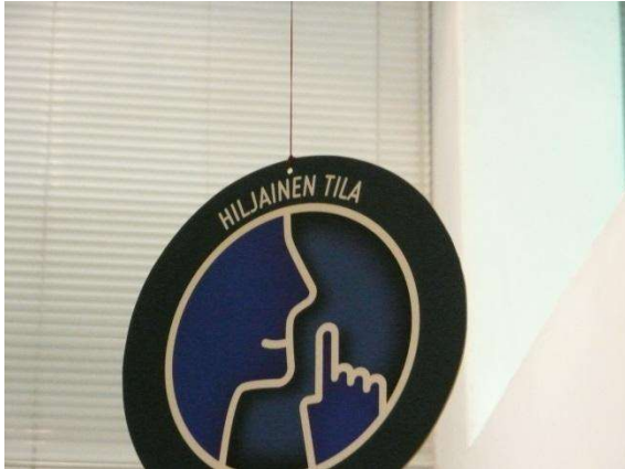
Fig. 3 “Silent area”

insight into different interpretations of the task. We suppose that Václav focused more on the textual element of the sign when claiming unintelligibility, while Stéphane considered ‘understanding’ a semiotic meaning-making process in which different features of signs are all important, and textual information can even be neglected. The sign in question (Fig. 3) hangs in one of the reading rooms of the library and the text in Finnish says ‘Silent area’.