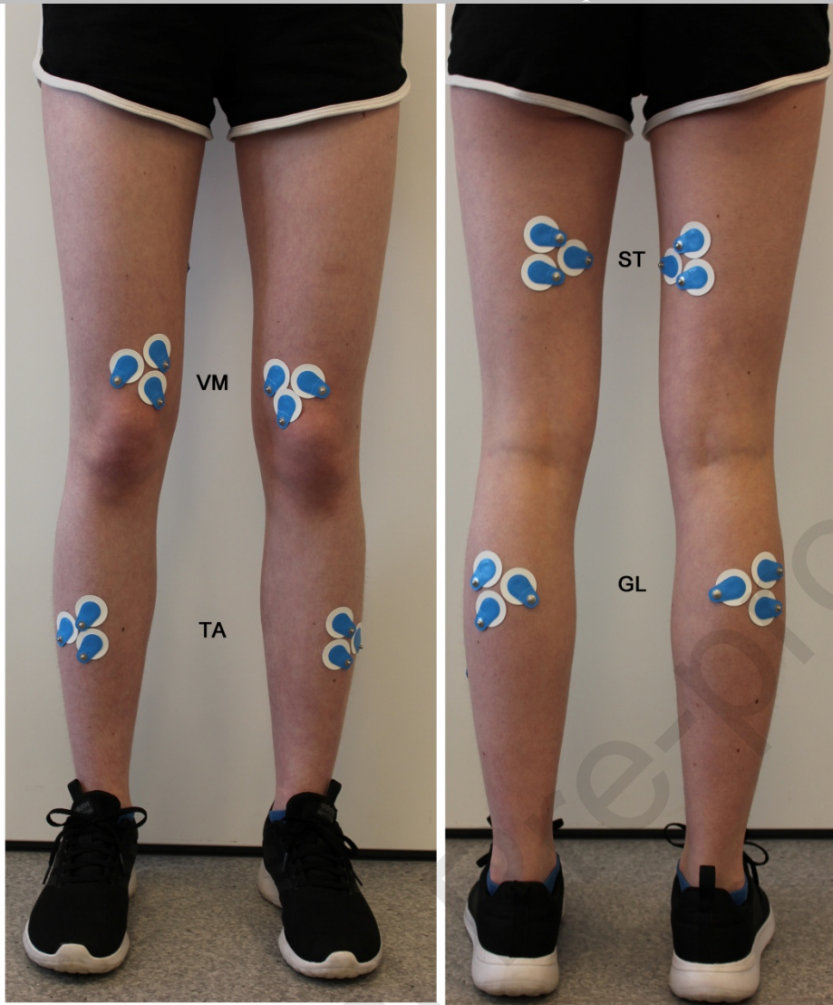
Fig. 3. Surface electromyography was evaluated on the following muscles bilaterally: VM = vastus medialis, ST = semitendinosus, TA = tibialis anterior, LG = lateral gastrocnemius.