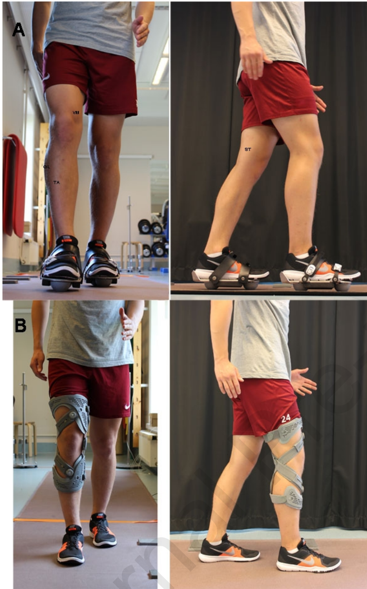
Fig. 2. Biomechanical footwear (A) and Unloader ® knee brace (B) shown in the experimental condition on the GAITRite ® mat.