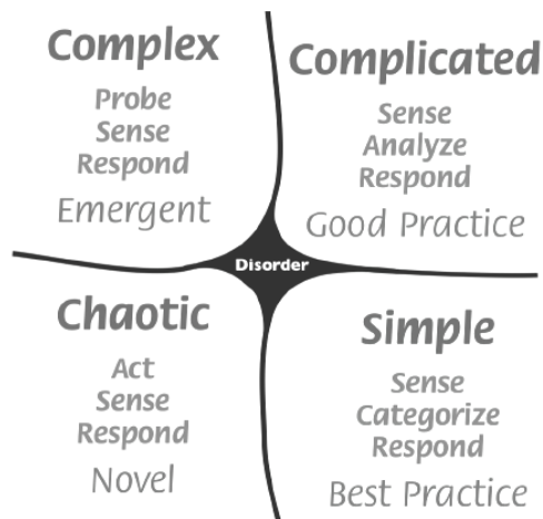
Fig. 1. The Cynefin Framework

The Cynefin framework (Figure 1) is a decision-making tool from the field of knowledge management and complexity science [16]. It is intended to help its users make sense of the current situation in order to act accordingly. To this end, it splits decision-making circumstances into five domains, discussed below. In the context of ISUs, it can help us better understand why practices and methods applied in ISUs either support or do not support their service and business development. We utilized the Cynefin framework, as it was adopted successfully in research about software startup before [31] (section IV).