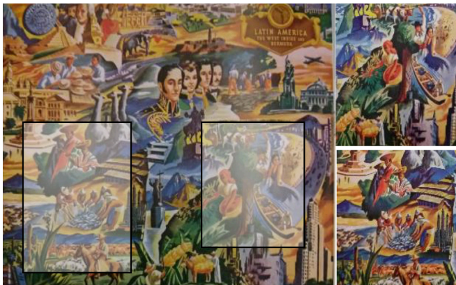
Figure 4. A portrait of Latin America and its people