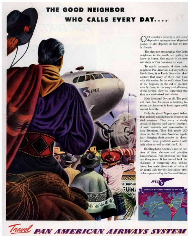
Figure 3. The Latin Neighbors in PAA's Grand Narrative