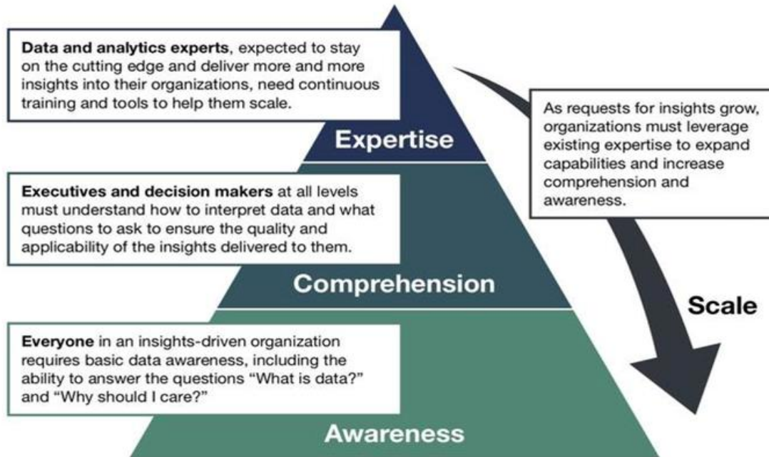
Figure 3: ICT and the data value pyramid

Overall, our findings suggest that ICT diffusion has behaved differently in high-income and low-income economies. This highlights the ideas of responsible