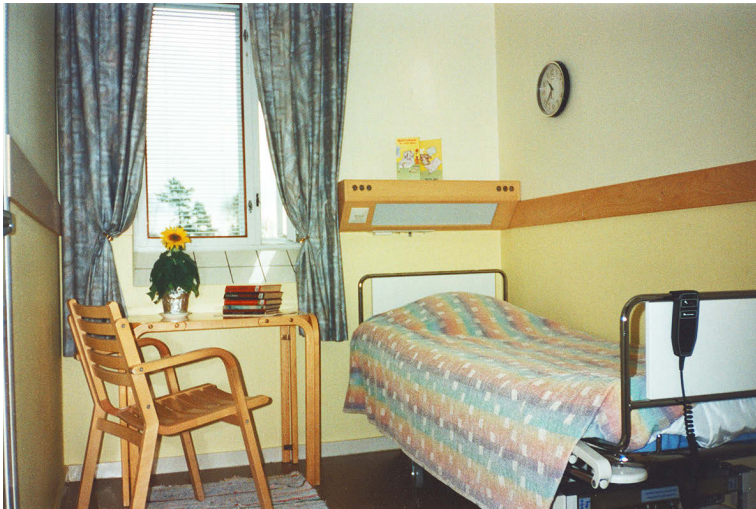
Fig. 2: Halikko hospital, © The Hospital District of Southwest Finland/Turku Lazaret Museum