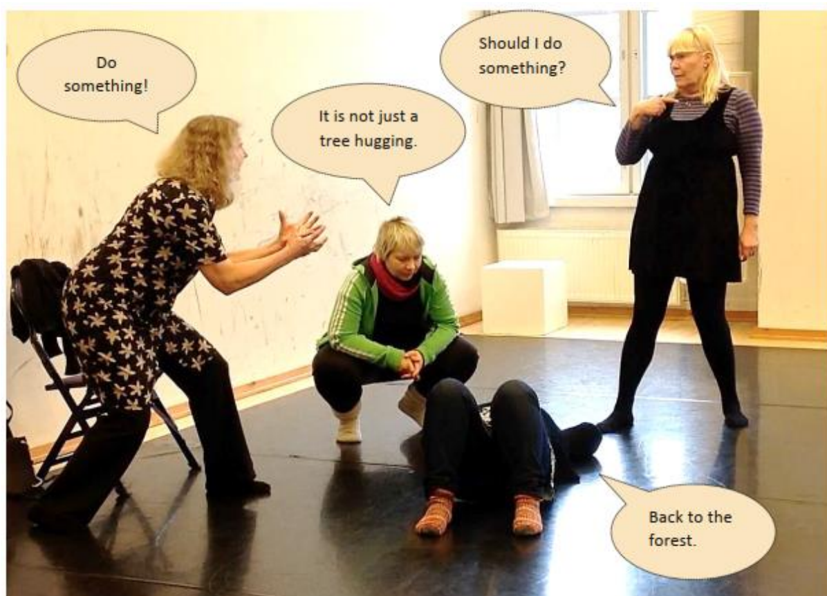
Figure 2. Different aspects of DESF.

Below, we have chosen to present the discussions and preparations related to two of the still images to serve as examples of the students' work. The first example, Figure 2, illustrates different aspects appearing in the group discussions: self-reflection, a critical pedagogical perspective, and a societal perspective. The transformation from the themes of the reflective discussion into a joint still image is also illustrated in Figure 2. The second example (Figure 3, which is presented later) is then discussed and presents the participants' perspectives on the course's theme, "Social Responses to Sustainability." Both of these still images were created during Workshop 3, but the technique was used in other workshops as well.