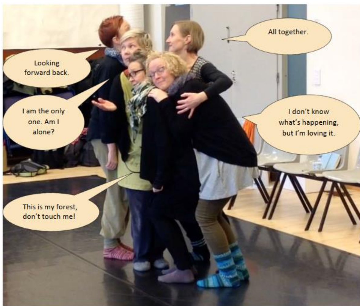
Figure 3. Still image – reflecting on the personal and the other, the relations between individual and social in DESF.

According to their discussion before making their still image, the first person on the left is saying that drama allows for exploration of a wider time perspective on sustainability dilemmas: “looking both to the past and to the future.” All the others seem to put forward a different aspect of the relation between the personal and the collective, which is very central in sustainability education. The second person on the left reflects on “being alone, but together,” having space for her own thoughts parallel to being part of a group. The third person on the left reflects on how the drama practice changed her personal zone in the forest to become a collective space and how she has a strong feeling of ownership with her own forest at home. The first person on the right reflects upon how drama brings people together and connects people, enabling collective encounters with different issues, and is thus empowering. The second person on the right reflected on how she explored the role of “a bad person” in the roleplay. She played the role of a “free rider,” reflecting a careless attitude