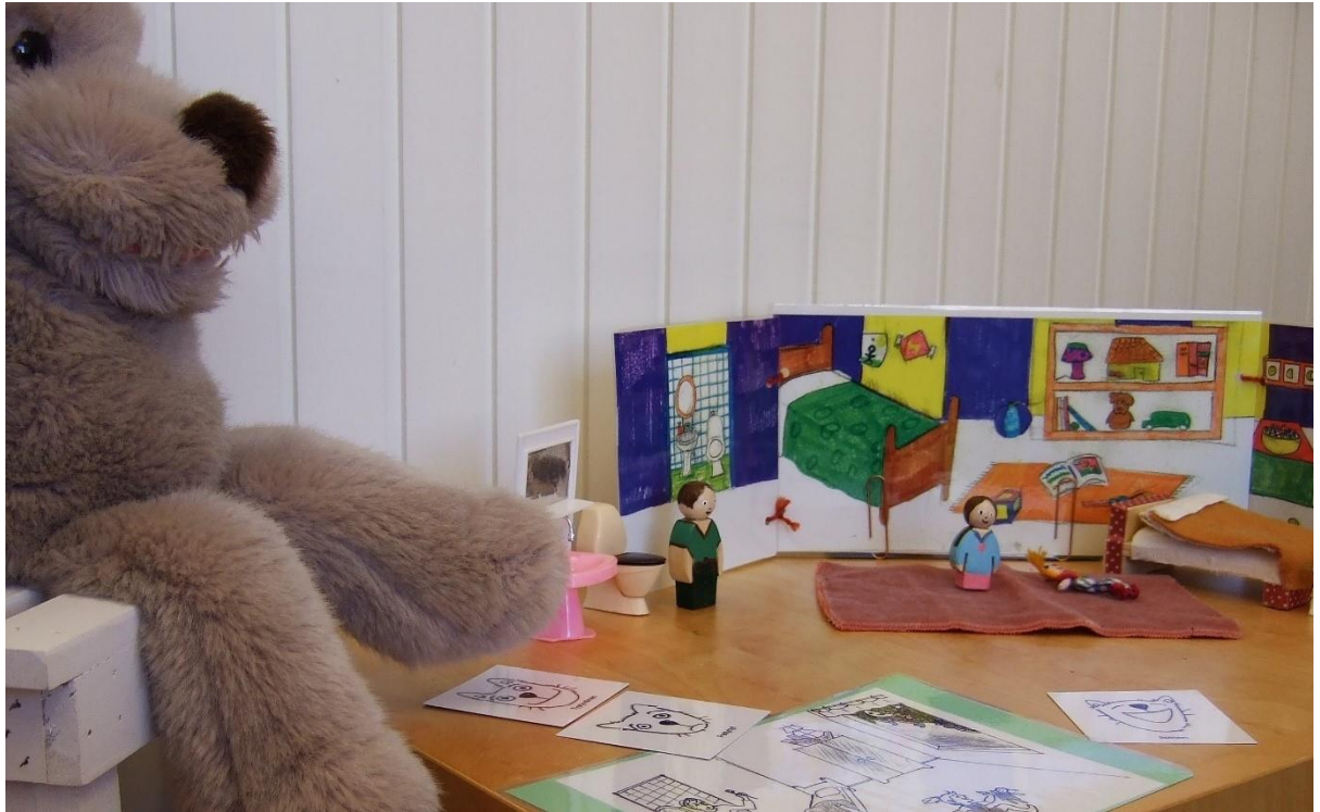
Picture 1. The Barney puppet, figures, vignette-picture, emotion cards, and other play materials used in the SMPT sessions.

The SMPT sessions proceeded according to the following structure: