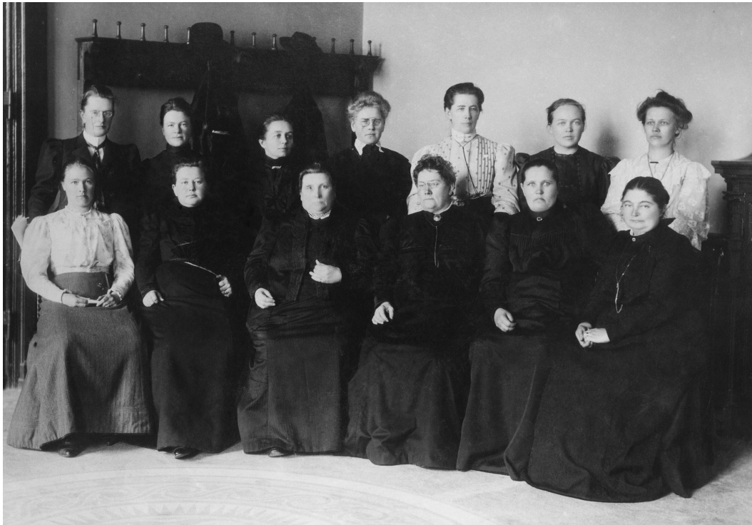
Thirteen out of the nineteen first women MPs elected to the Finnish parliament in 1907. The 29-year-old Hilja Pärssinen is sitting first on the left together with more mature bourgeois ladies.