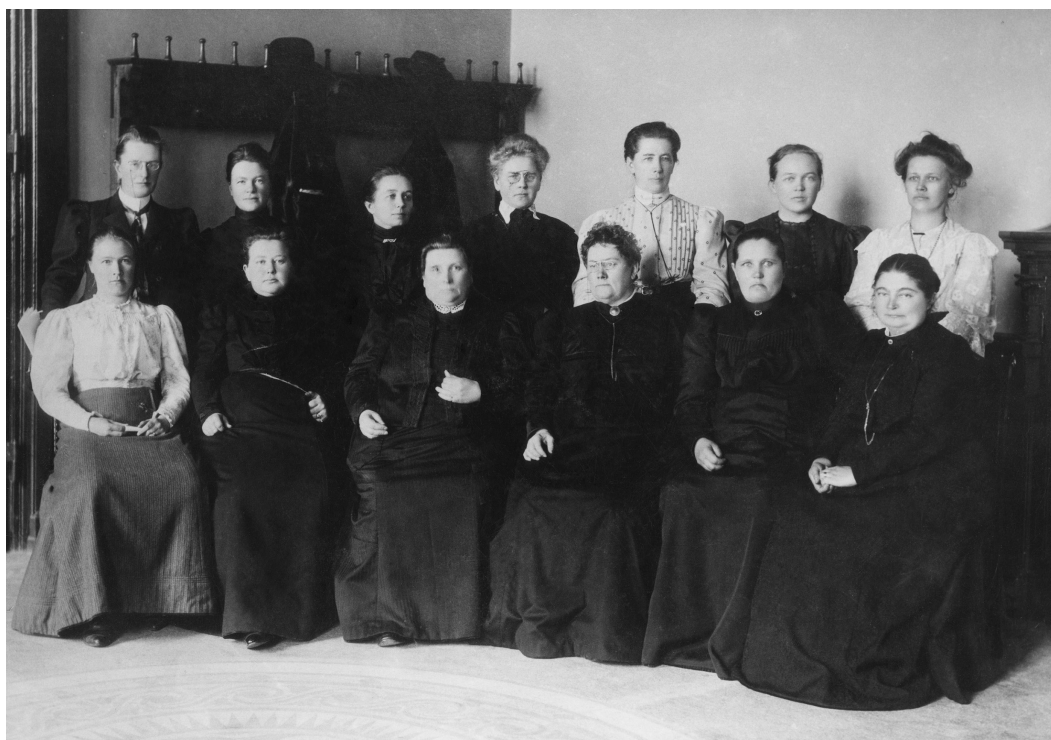
Thirteen out of the nineteen first women MPs elected to the Finnish parliament in 1907. The 29-year-old Hilja Pärssinen is sitting first on the left together with more mature bourgeois ladies.