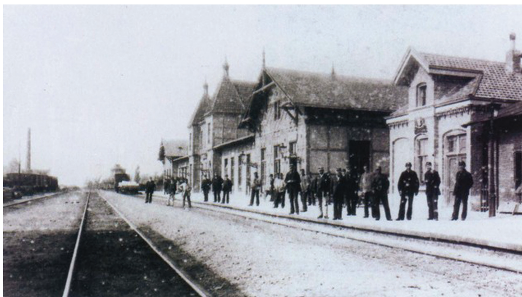
The Oldenzaal border station (1885), the nexus of competing ideological discourses on women's rights in the morning of 10 September 1913.