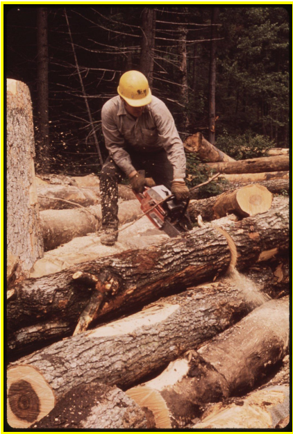
Figure. 1. A lumberjack's operative position, aligning hand and vision perpendicularly against the object to be cut.

We cannot exhaust the vast literature on the relations of mind and body beyond recognition and homage. The reader may want to refer to, say, Dawson (2013), who provides a big picture of the interconnections of mind with the body and world. Nevertheless, we interpret that there is a safe ground to go further with the idea of grasping as a natural metaphor for what a concept is good for, as something that becomes accessible from an optimal working position, in a manner comparable to the work of a hand guided by vision. The hand approaches objects from a particular angle and from a point of view that best orientates the concrete operation. Consider an agent engaged in concrete work, who seeks a perspective - or an operative position - in which the object's most critical dimension for successful operation is as perpendicular as possible against the eye's view. Then it optimally reveals an angle as broad as possible and contributes to an optimal precision to access the object (Image 1). In contrast, it would not facilitate the operation to see the board from one of its ends and operate the saw between left and right, which would be both visually hard and ergonomically ineffective. Following the dynamic assumption of Neisser's perceptual cycle, we assume that the operative position and the optimal perspective is not given, but results from learning through explorative action (1976).