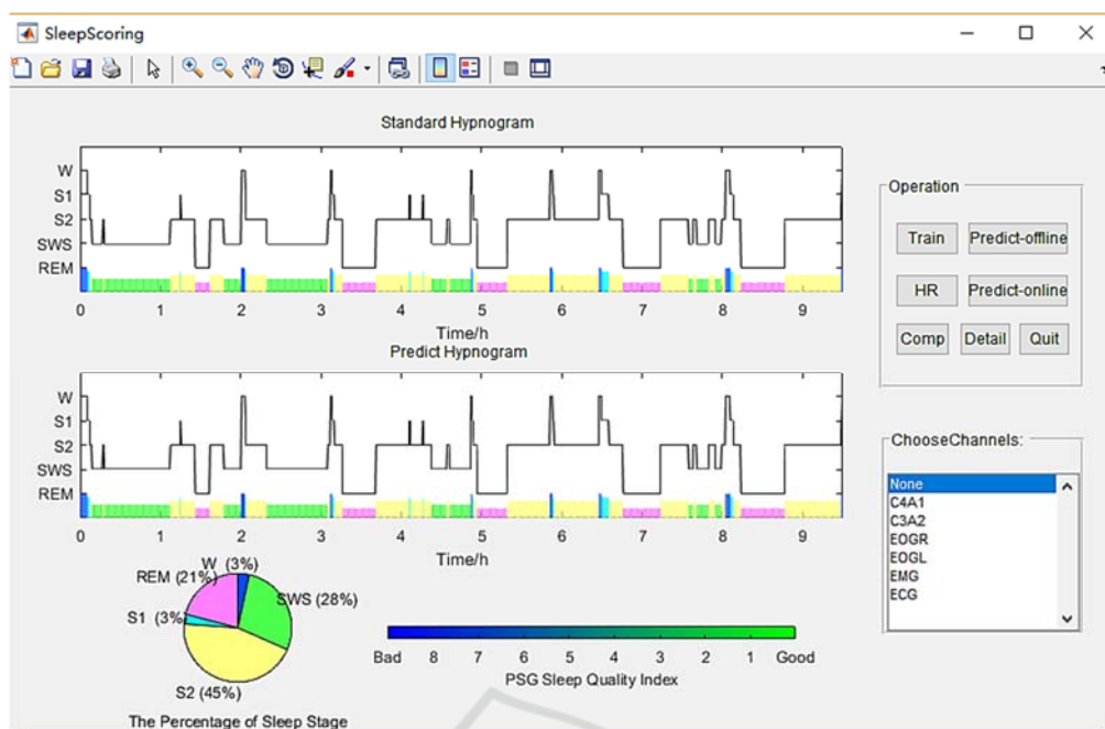
Figure 1: The interface of sleep scoring toolbox.

organs. Signals recorded from different physical areas change with the sleep cycle. The multi-modality signals' contribution to sleep scoring has been explored in several studies (Gharbali et al., 2018; Yan et al., 2019; Šušmáková and Krakovská, 2008). Özşen concluded that as the sleep deepens, the frequency of EEG signals attenuated gradually, along with rare eye movements, low electromyography (EMG) activity and slow heart rate (Özşen, 2013). Ebrahimi and his colleagues found that under the control of parasympathetic nervous system and sympathetic nervous system, cardiovascular and respiratory behaviours fluctuated with the alternation of sleep stage (Ebrahimi et al., 2015). It has demonstrated that features from multi-modality signals were beneficial to the improvement of scoring accuracy (Boostani et al., 2017).