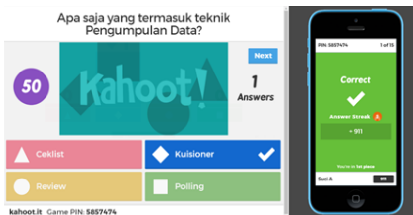
Fig. 3. The use of Kahoot platform to provide an interactive quiz.

Online Quizzes to provide interactive course contents. This fourth solution relies on the "Be interactive" principle, which explains the importance of interaction between teacher and student and between students in a virtual class. Based on the results of interviews with the teaching team to increase the interactive activities, we conducted an online quiz with Kahoot's game-based learning tools in one session (See Figure 3). The proposed solution is also supported on the basis of an interview that there are no online quiz questions yet for the learning content.