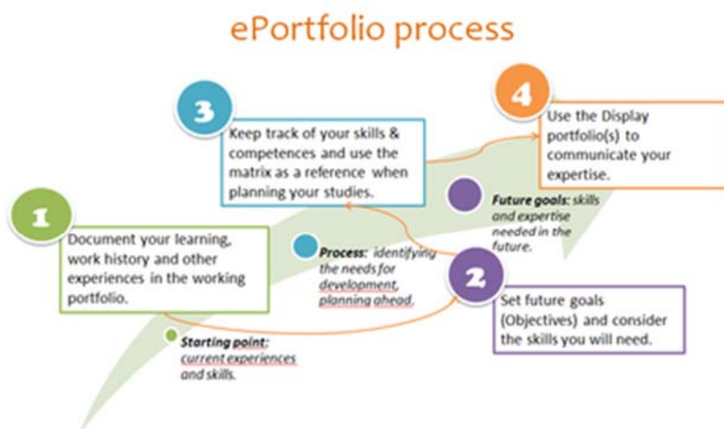
Figure 1. ePortfolio process of the University of Jyväskylä ( https://www.jyu.fi/studentlife/en/eportfolio )

The ePortfolio environment is a combination of a working portfolio, objectives, skills and competences as well as presentation portfolios. The working portfolio helps students to write down what kind of previous skills they have. It also encourages students to think about their extracurricular skills. The working portfolio works as a private environment, where students can add their work experiences, studies, hobbies, voluntary work and international experience, for example. ePortfolio enables students to build their own skill archive in which they can collect different kind of documents, texts and other electronic material. Most importantly ePortfolio is not only a tool where students can gather samples of their skills and demonstrate their previous experience, but students will also be able to plan and design their own studies in a way that is meaningful for the future. Therefore, ePortfolio provides an opportunity to think of one's professional aims and goals. When setting a new goal, students can use ePortfolio to define what kind of special skills are needed to achieve this goal. This helps to plan studies in a goal-oriented way. A crucial element in ePortfolio is that students are able to tell and recite the skills that they have. In the Presentation portfolio, student are able to practice how to express themselves in the form of shared texts, pictures, videos, blogs, audios etc.