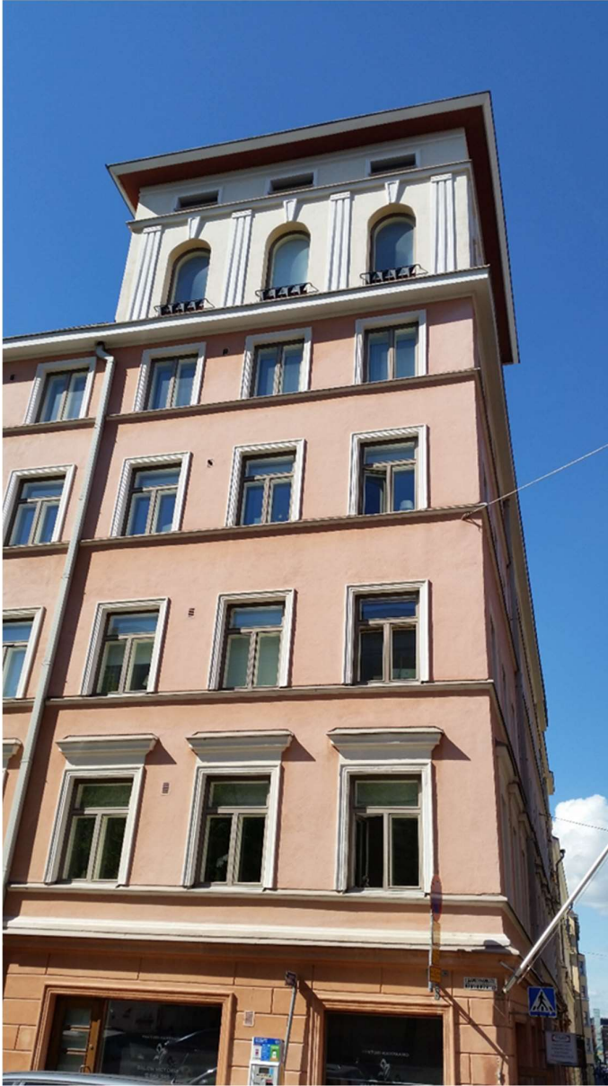
Figure 5. Apartment block where Jansson lived in her tower studio.

Based on the field notes, it is not only factual knowledge – long-held or recently obtained – of the author’s biography which allows me to “activate” (Westover 2012, 7) the surroundings. The often-mentioned act of “seeing” is recurrently paired with “in my mind”: my own imagination plays a key role in creating glimpses of Jansson’s life at associated places and piecing the biographical narrative together. Plate (2006) and Bom (2015a) observe that historical facts can become less important for literary visitors, as perceived experience – for example, of going back into the past – relies more on