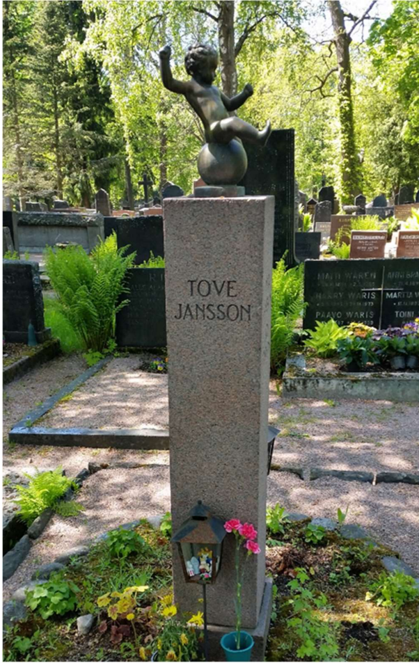
Figure 3. Tove Jansson's grave, Hietaniemi cemetery. Photo by author, 2017.

While no augmented reality software was used during the walk to enhance the urban space (Sandvik and Waade 2008), personal mobile devices were used for consulting the itineraries, navigating, and fact-checking. Because it is not a guided tour, visitors (like my colleague and myself) act as their own guides, so much depends on one's ability to find the required information and to utilise it during the tour. Instant access to biographical information via mobile devices enabled our independent navigation through the city and allowed us to correlate the places visited with specific events in Jansson's life.