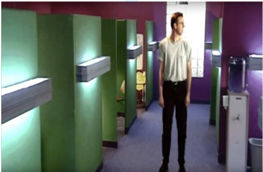
Figure 2. Phantasmagoria 2: A Puzzle of Flesh gameplay scene.