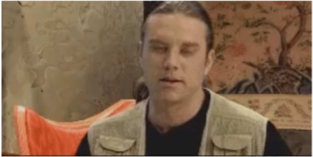
Figure 4. Phantasmagoria opening scene.