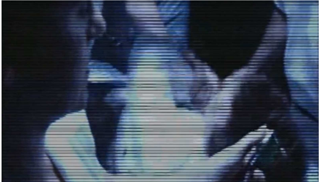
Figure 1. Phantasmagoria 2: A Puzzle of Flesh opening scene.

1 2 3 4 5 6 7 8 9 10 11 12 13 14 15 16 17 18 19 20 21 22 23 24 25 26 27 28 29 30 31 32 33 34 35 36 37 38 39 40 41 42 43 44 45 46 47 48 49 50 51 52 53 54 55 56 57 58 59 60