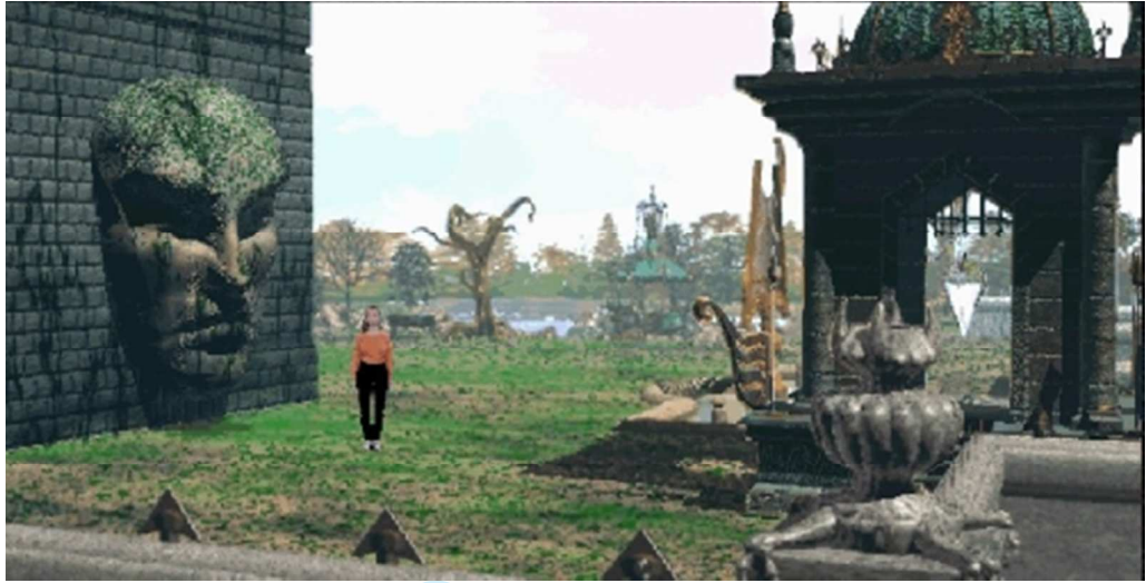
Figure 3. Phantasmagoria gameplay scene.

1 2 3 4 5 6 7 8 9 10 11 12 13 14 15 16 17 18 19 20 21 22 23 24 25 26 27 28 29 30 31 32 33 34 35 36 37 38 39 40 41 42 43 44 45 46 47 48 49 50 51 52 53 54 55 56 57 58 59 60