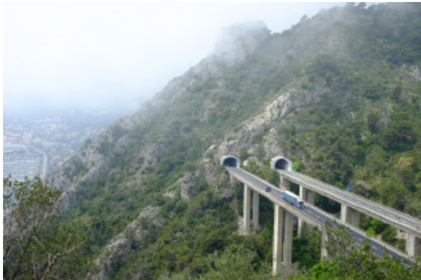
Image 2: View from the Italian side of the Path of Hope towards Menton, France. The fatal motorway cuts through the mountains.

Today, most people cross from Italy to France by rail or road without noticing the presence of a nation-state border. As cars pass between two tunnels on the highway, only the flash of a simple sign informs drivers that they've crossed an internal European Union border. Official border controls were abolished in 1997 when Italy began implementing the Schengen Agreement. Currently, twenty-six European Union countries are part of the Schengen area and do not have internal border controls. Up on the mountain, an old fence is the only reminder that the border was once controlled. Or, this is how it appears to European Union citizens and, more importantly, white EU citizens. An Italian jogger running with his dog, whom I came across after I had found the men's suit, assured me that I would have no problems hiking in the area; the border police would only be interested in the ' clandestini '. For those who are non-citizens or appear to be 'migrants', this is a landscape where the border becomes visible and manifests its violence.