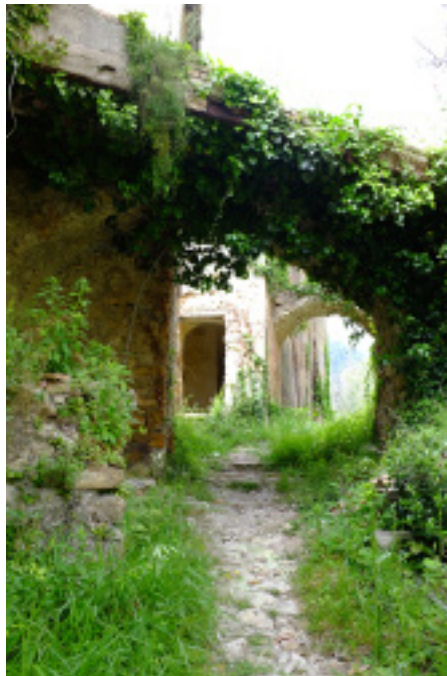
Image 3: The ruins of Gase Gina have offered a shelter along the Path of Hope since 1944 when the French soldiers bombed the farmhouses.

station in Menton when I asked for directions complained that the frequent identity checks were a nuisance because they slowed down traffic. But the French were merely inconvenienced and, anyway, they weren't the targets. Those who were to be prevented from crossing the border, and subjected to racial profiling by the French border guards, were migrants from Africa. To cross the border, the non-citizens tried to look like they belong; they prepared for the journey by getting haircuts, buying new clothes, or carrying Le Monde . The police caught them anyway, put them in a van, and drove them back to Italy. In Ventimiglia, the Italian town closest to the border, migrants slept in the railway station. Others congregated in parks, waiting for an opportunity to move on or return back a temporary home in northern Europe. Many of the migrants had returned to Italy from countries such as Germany, because they needed to renew their Italian residence permits. Identity checks at the border didn't really prohibit movement but punished and disciplined the mobility of certain people. They also made the crossing violent. In the tunnel of the motorway, below the Path of Hope, a 17-year-old Eritrean girl died in October 2016 when she was hit by a car while walking to France.