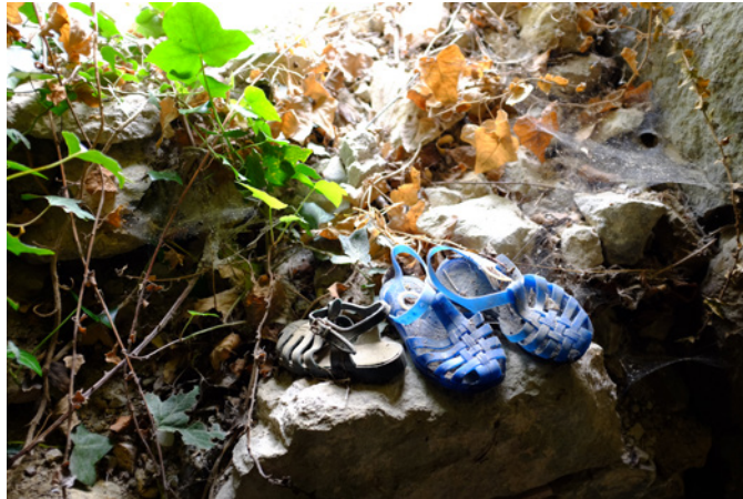
Image 7: Discarded objects in Case Gina elicit imaginaries of individuality and intimacy. Did a child get better shoes and left these behind? Were the shoes left for someone who might need them?

While I saw the traces of former and present day bordering along the Path of Hope, the walking from one country to another also revealed that borders not only separate but also connect people. The place also has traces of local solidarity towards migrants. It was difficult to identify the unmarked beginning of the path in Grimaldi but the two-hours trek itself was easy. Local hikers and cultural activists had just cleared the path in 2015 when the alternative route began to be more important again. They wanted to make the crossing easier for the migrants who often walked at night. Moreover, it was difficult to spot the small opening in the old border fence in daylight. Italian artist Andrea d'Amore Espanso used fluorescent green to paint the word HOPE on a piece of metal above cut in the fence. This installation shines like an emergency exit in the dark, pointing towards the right direction. It transforms the meaning of the border from an exclusive wall of separation and selection into an open door that welcomes everyone who goes through it.