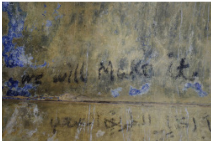
Image 4: We will make it. Fresco of transcultural memory on the walls of Case Gina

‘If you have to live, live free! Or else die motionless, like the trees, motionless’ (in Arabic)