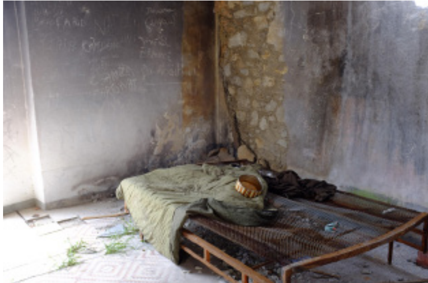
Image 5: Layers of histories and spatial links merge in the ruins of Case Gina, creating a site of multidirectional memory.

places and ruined buildings 4 . The ruins of the Case Gina can be viewed as a site of alternative communication: encouragement and warning among those hiding from authorities. Even though invisibility is what people sought in this place, many desired to make their presence and journey known.