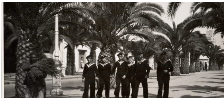
Finnish seamen from Suomen Joutsen, a school ship for Finnish Navy, in Lissabon 21.-22.4.1934.