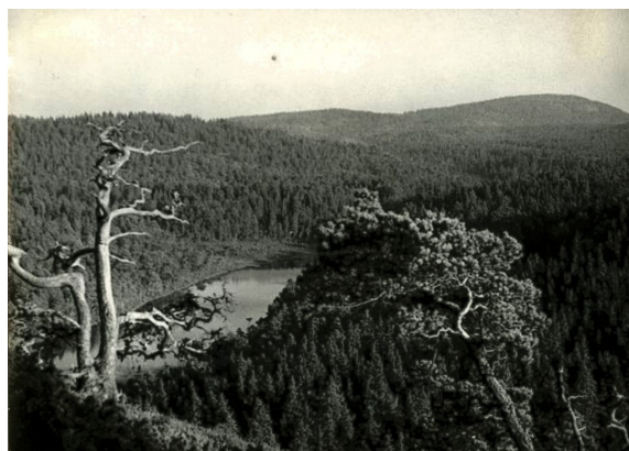
Figure 3. Scenery from the Suursaari Haukkavuori Hill.