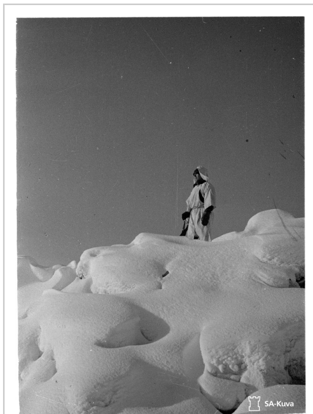
Figure 7. Caption in Das ist Suomi : “The Finnish man guards the border between the east and the west on the fjells of the North”; original caption: “A guard on the fjells of Petsamo”.

The Finnish soldier is presented as always ready and waiting, standing on the shores of Finland, which work in his favour and as his allies with their rocky terrain. He lives, first and foremost, close to and from the grand Finnish nature, and is a farmer and a warrior of the wilderness. He is illustrated as fighting his enemy using his wits in the wild, even if he is under-equipped, as was the case during the war, and with strong sportsmanship skills such as skiing. The Finnish man thus draws his strength from the interaction with nature, and therefore also the sports arenas are located in nature, such as the Vierumäki sports college pictured in the book.