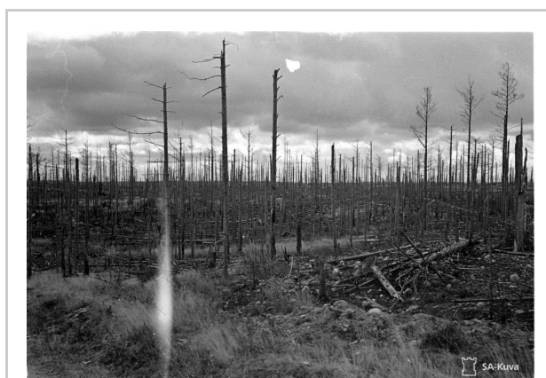
Figure 4. Original caption: “Images from the ghost forest in Taipale”. Photograph: SA-kuva 41759; Gunnar Strandell, Taipale 1941.