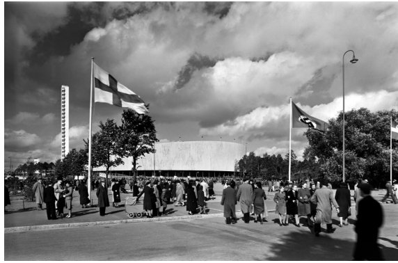
Figure 1. Finnish, Nazi German and Swedish flags flying side by side in front of the Finnish Olympic Stadium, during the three countries' athletic games in Helsinki in 1940; these games are illustrated also in the book Das ist Suomi (Suova 2 1943a, 231–232). Olympic Games were supposed to be in Helsinki in 1940, but this was stalled by the war.