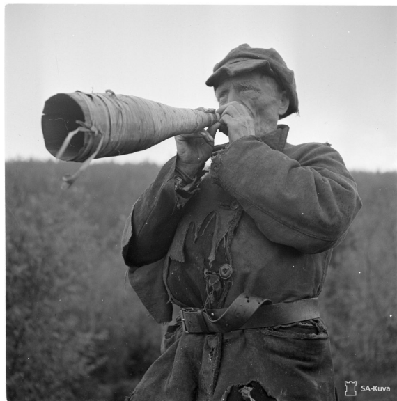
Figure 6. Old Karelian man blowing a traditional birch bark horn in Eastern Karelia.

Orthodoxy was also used to represent the mixture of Christianity and folk traditions – a suitable mixture of civilized Finnishness and original, primitive Karelian culture. The praasniekka celebration illustrated in the book was one expression of this mix. If primitivity was considered as something negative in relation to the Sámi, it was presented as authentic and pure in the case of Karelia; it was the right kind of Finnish primitivity. In the images, the Karelian people are seen dressed in old-style clothing, playing ancient instruments, such as kantele and birch bark horns, and weaving traditional tapestry, ryijy , signifying their folk ways (Figure 6). These images reflect familiar trends in the arts and the primitive Karelian way of life features in many classic national romantic paintings, such as Akseli Gallen-Kallela's renowned painting "A Herder boy from the Lake Paanajärvi" ( Paanajärven paimenpoika , 1892).