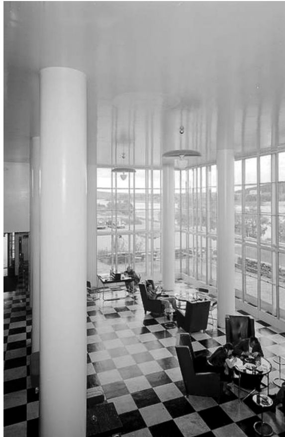
Figure 5. Functionalist Hotel Pohjanhovi in Rovaniemi, the capital of Lapland. Photograph: National Board of Antiquities HK19731119:823; Otso Pietinen, Rovaniemi 1939; CC BY 4.0.

The roads are very visible in the photographs of Lapland's landscape, and all seem to be in a good condition for passenger cars to make their way along the so-called Arctic Ocean Road ( Eismeerstraße ) to its northernmost point Liinahamari on the coast of the Arctic Ocean in Petsamo. However, in reality Lapland's infrastructure and road network were very rudimentary during the war, which hindered the German war efforts in the north and forced them to concentrate on large infrastructural projects behind the frontlines with the Prisoner-of-War and forced labourer workforce. [61] The wartime marked a significant increase in the northern infrastructure, owing much to the German operations, and the Arctic Ocean Road from Rovaniemi to Petsamo was also of key importance as an artery of transit for the German troops. As another example, the road leading to a functionalistic hotel built high on the Pallastunturi Fjell, and its own, rare electric station in the middle of nowhere, are brought up, again emphasizing the apparent modernity of Lapland. The presentation underlines these comforts in the middle of wild Arctic landscape for the Germans, prospective post-war tourists.