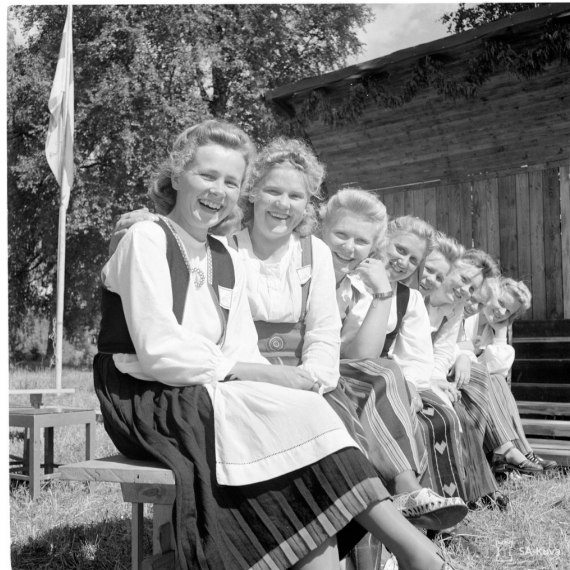
Figure 2. Original caption: “Maidens in national folk costume”; during a Midsummers celebration in Räisälä, Karelian Isthmus. Photograph: SA-kuva 130426; Oswald Hedenström, Räisälä 1943.

However, Finnish women were selected, much to a national pride and surprise, three times as Miss Europe in the 1930s (1934, 1937 and 1938). [38] When Miss Europe 1938 Sirkka Salonen, who is also illustrated in Das ist Suomi wearing a folk costume on a field, was interviewed for the state radio, she said that she wanted to prove to Europeans that the “Finns are not slant-eyed Mongols”. [39] Thus the emphasis on the stereotypical blonde and blue-eyed beauty of the Finnish girls throughout the book obviously attempts to substantiate to the German audience that Finland is part of the “West” (Figure 2).