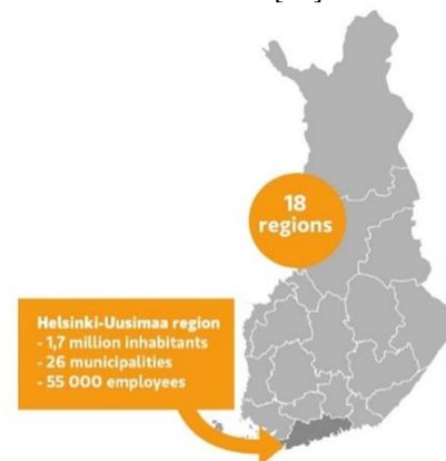
Figure 2. Regions in Finland.

The largest new county is Helsinki-Uusimaa region. It is situated on the south coast of Finland, and it is home to around 1.7 million inhabitants, which is about 30 percent of the country's total population. Fig. 2 shows Helsinki-Uusimaa region geographical position in Finland. In the Helsinki-Uusimaa region, the social and healthcare services of 26 municipalities and specialized medical care from HUS (Hospital District of Helsinki and Uusimaa, Helsinki University Hospital) and about 55,000 employees will be transferred to the county to be formed. At the same time, the province is also responsible for the transfer of 25 different governmental activities that have been either state activities or statutory activities organized by municipalities. The Epic system delivered by Apotti project has been selected as a social services and healthcare system supplier in Helsinki-Uusimaa region. Apotti is an extensive Finnish change project of the social services and healthcare field. Apotti project is building the world's first information system that integrates social services and healthcare services [22].