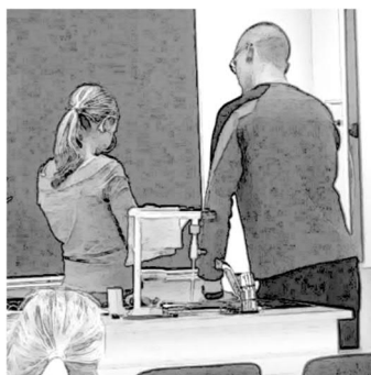
Fig 4.2. Line 19.