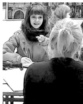
Figure 3.2. Line 21.

The teacher invites a volunteer to do a counting rhyme and provides the first few words of one such rhyme (1). She treats the subsequent silence as an indication that students may be unfamiliar with rhymes by enquiring whether students have heard about such rhymes (3). Susanna's self-selected response (4) first asserts recognition of the rhyme ( yes ) and then claims the ability to do it by way of stating that the students have done it already a long time ago. Such a collective claim can be heard to imply that such a rhyme is perhaps a slightly childish thing to do now that the students are teenagers, foreshadowing that its production is not a straightforward matter.