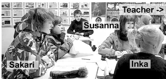
Figure 3.1. Line 7.