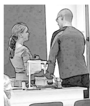
Fig 4.3. Line 20.

Neea's call for attention (1) secures the teacher's availability and initiates one-on-one interaction with