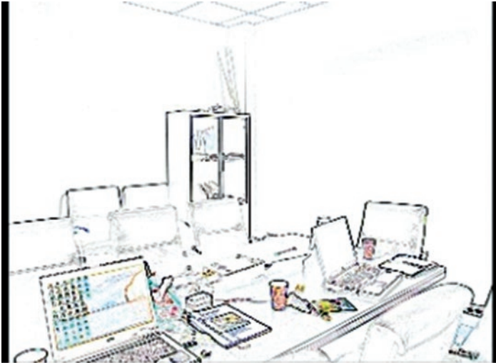
Fig. 9.1 Negotiation room