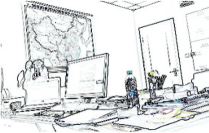
Fig. 9.2 Office