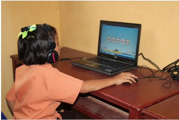
Fig. 1 A child playing GraphoGame SI

grade elementary school reading textbooks. Using International Phonetic Alphabet (IPA) transcriptions of every word included in the database, we determined the (relative) frequencies of the grapheme-phoneme correspondences and syllables within the words. This information was used to determine the order in which the items were introduced in the game. All auditory stimuli and instructions were recorded from one male and one female native speaker of Standard Indonesian. All items were subsequently evaluated by other native speakers with respect to their prototypicality, and only the most prototypical items were used in the game. This resulted in one to three different spoken realizations per target.