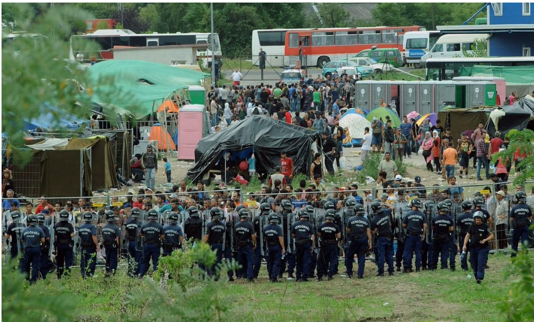
Picture 5. Passivation of a homogenized group

The Guardian does not exclude asylum seekers. It represents them as active agents in 75 per cent of the photos. Half of the images depict asylum seekers as individuals and half as homogenized groups (Picture 5). One of the photos can be interpreted as a cultural categorization as it depicts a woman in a hijab in the center of the image (Picture 6). There is also a specification which portrays a man in a wheelchair.