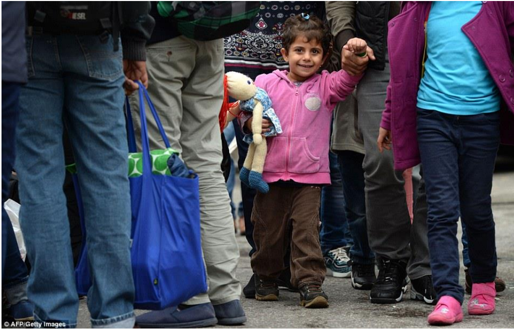
Picture 1. Interaction from the close distance, front and eye level

from the front, like in the first picture, and the rest are shown from the side or the back. A majority of photos do not have direct interaction with the viewer depicting asylum seekers as objects that the viewer can scrutinize. Only in 22 per cent of the images the asylum seekers look at the viewer interacting with them (Picture 1).