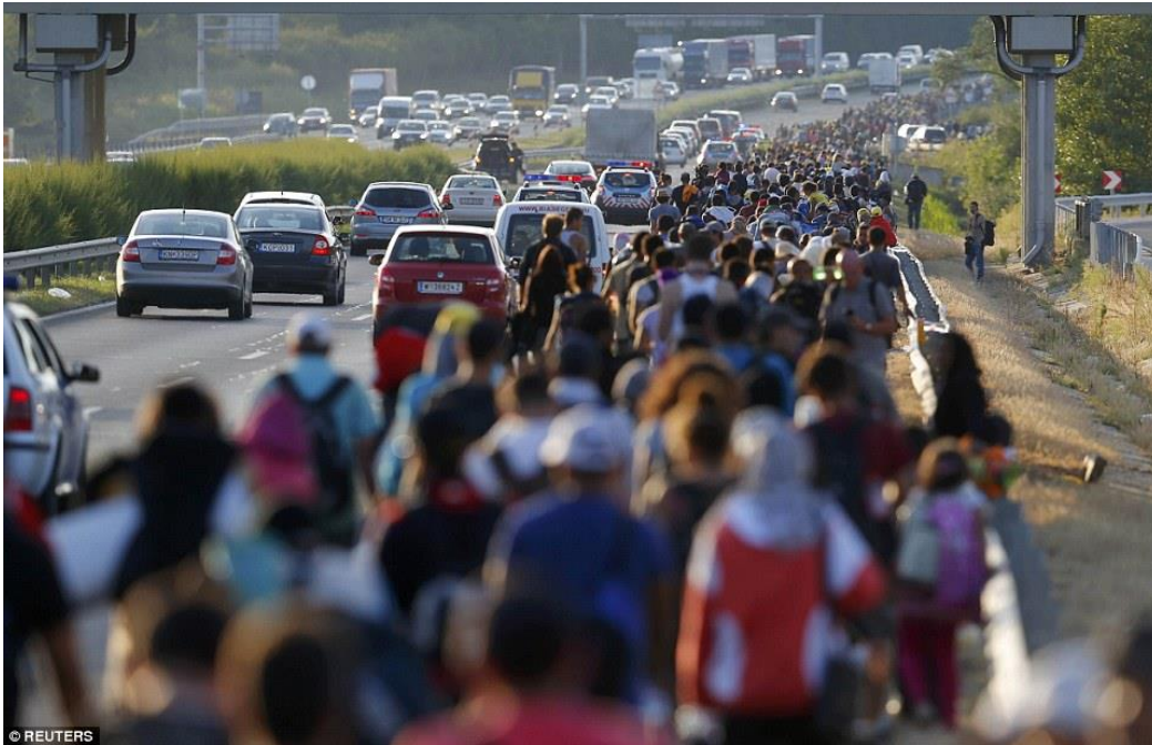
Picture 2. Homogenized group from the back, afar and above