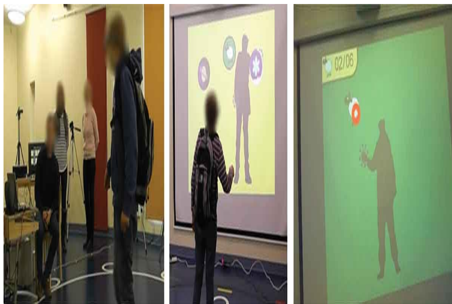
Figure 1. Video camera view of the broad social situation (frame 1), a child playing the Kinect game (frame 2) and an eye-tracker view (frame 3).