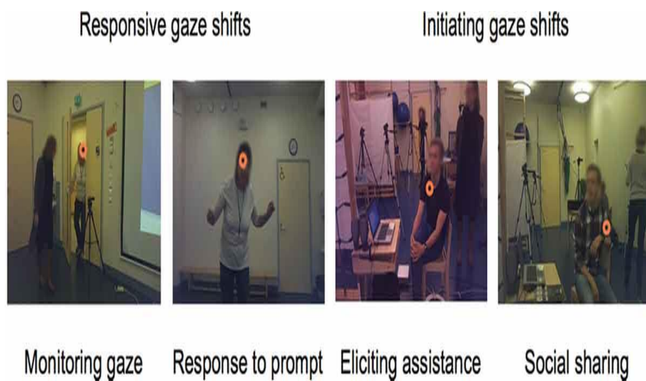
Figure 2. Four functions of gaze shifts identified.