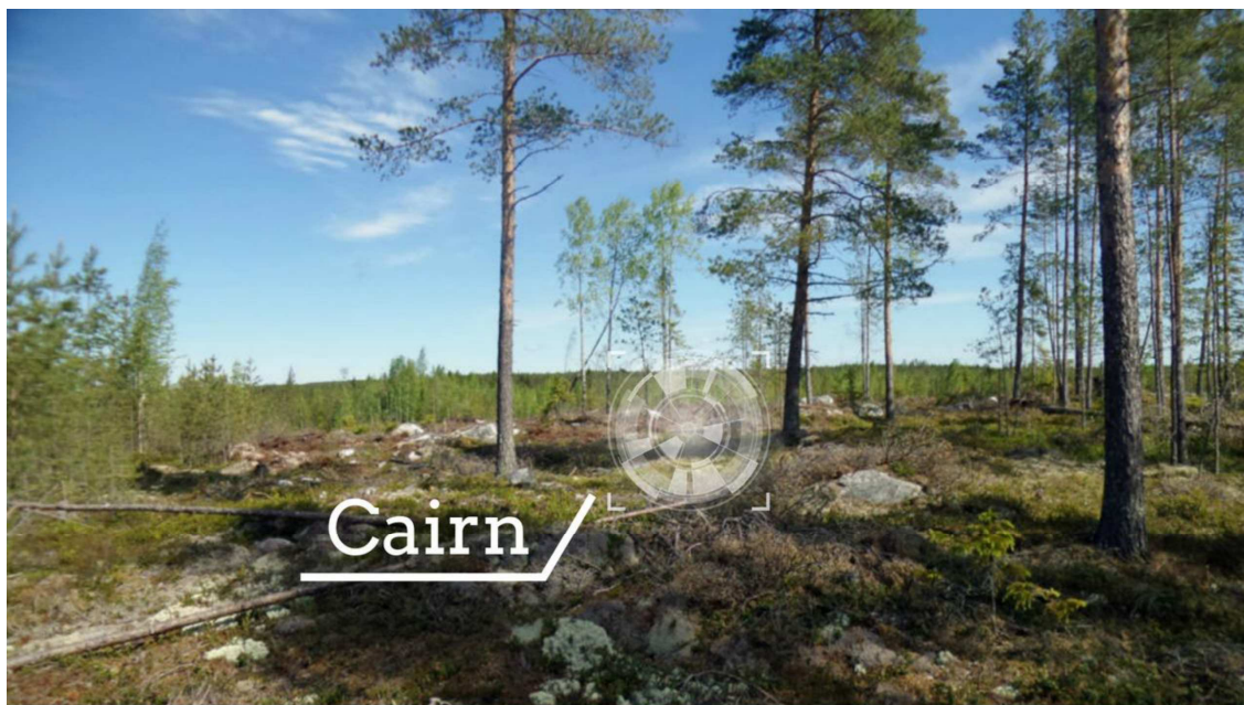
Fig. 4 – Museum-cache at the cairns as seen through a smartphone, Finland.