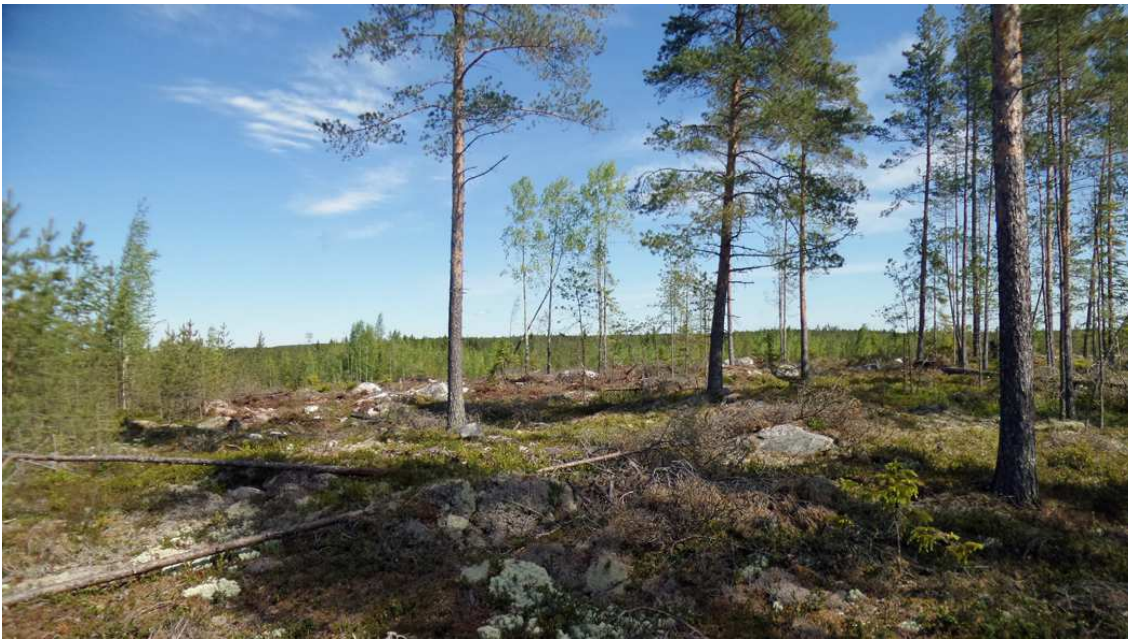
Fig. 2 – Cairns, Finland.